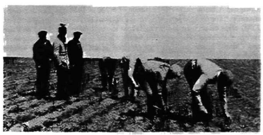
Thinning a large beet acreage, 1930's.