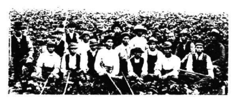
Japanese Contract Labourers of the Knight Sugar Co., 1904.

Thus the Knight Sugar Company was never able to obtain enough beets to operate at an efficient level, even with an attractive price of $5 a ton. Beet acreage in Alberta reached a maximum of 5,200 in 1908 and then decreased annually. The company tried to provide its own beets by planting as many as 2,000 acres on its own and hiring labour to work them, but it had no more success than the local farmers. Few whites wanted to hoe sugar beets. Japanese and Chinese labour could not be obtained in sufficient quantities without arousing community opposition to the importation of Orientals. Indians were less productive, sometimes damaged plants at the critical thinning stage and could not be counted upon to remain on the job throughout the season. When the twelve year tax exemption ended in 1914, the Knight Sugar Company's Board of Directors voted to cease operations, and the factory was dismantled and moved to the United States.