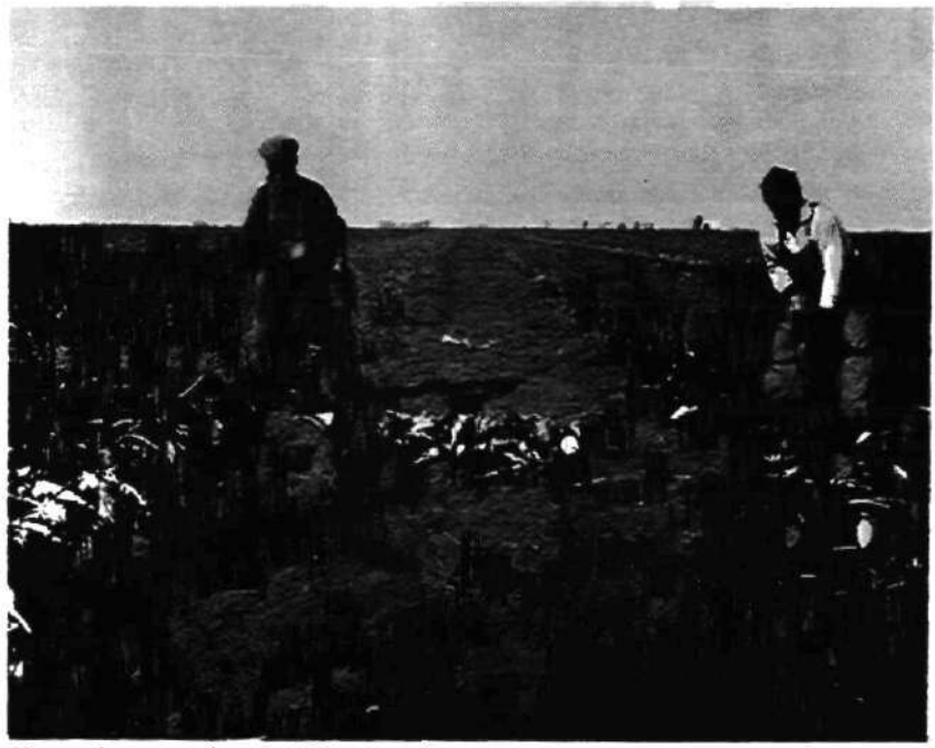
Harvesting sugar beets, 1930's.