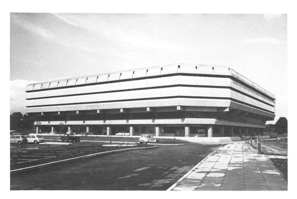
PRO, Kew, exterior.