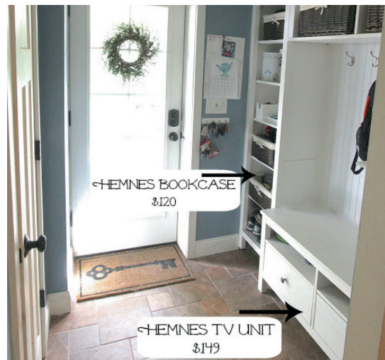
Figure 5. Repurposing furniture for a mudroom.

A third example repurposed a TV unit as a seating bench, and bookcase as storage in a mudroom, shown in Figure 5.