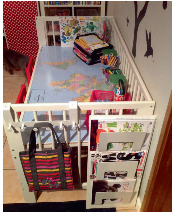
Figure 8. Children's table repurposed from crib.

The 3 categories overlap in multiple ways. A change in function may result in changes to both aesthetics and forms. Change in Form often involves the same function acting, e.g., storing, supporting, etc., on different objects. However, a literal modification in form is often required to accommodate the shape and weight of different objects, e.g., clothes vs. cleaning supplies vs. books. Change in Function applies a product to different uses, sometimes primarily by using in a different orientation, e.g., sideways (breadbox to mailbox), inverted (fruit bowl to lampshade), etc. Other cases involve the use of products as partially finished raw material (crib to table). An inexpensive coffee table provided the raw material for many hacks, e.g., headboard, coat rack, etc.