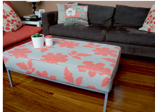
Figure 4. Coffee table converted to ottoman.

We categorized as Change in Form, when an existing product is reconfigured to better meet updated or slightly modified functions. When the original function becomes less relevant, the form of the product is modified to make the product relevant again. The hack fulfills the same or similar functions as the original product, but with an updated form. Examples include reconfiguring an unused wardrobe into a cleaning cupboard to store mops, vacuum cleaners, and cleaning supplies. Figure 4 shows an old coffee table converted into an ottoman by attaching a top cushion.