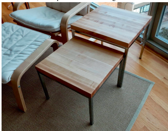
Figure 3. Replacing white tops of nesting tables with maple cutting boards. Image used with permission. www.ikeahackers.net/2013/10/klassy-butcherblock-tops-for-klubbo-tables.html

Figure 3 shows solid-maple cutting boards substituted for the standard white tops of a set of nesting tables.