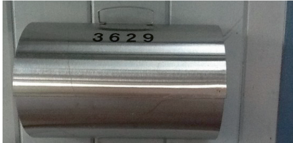
Figure 6. Mailbox repurposed from breadbox. Image used with permission. www.ikeahackers.net/2013/10/ordning-stainless-steel-breadbox-to-modern-mailbox.html

We used Change in Function to describe when a user repurposes a product to fulfill a significantly different function than intended for the product. For example, Figure 6 shows an inexpensive, stainless-steel breadbox repurposed into a mail box because existing similar products were too expensive.