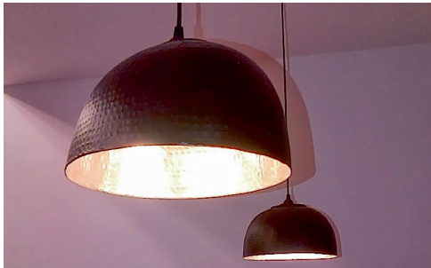
Figure 7. Fruit bowl repurposed into lampshade.

Figure 7 shows custom lampshades made using fruit bowls to emulate expensive lampshades.