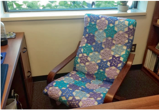
Figure 2. Crocheted cover for chair. Image used with permission. www.ikeahackers.net/2013/10/field-of-flowers-crochet-poang-chair.html

Figure 3 shows solid-maple cutting boards substituted for the standard white tops of a set of nesting tables.