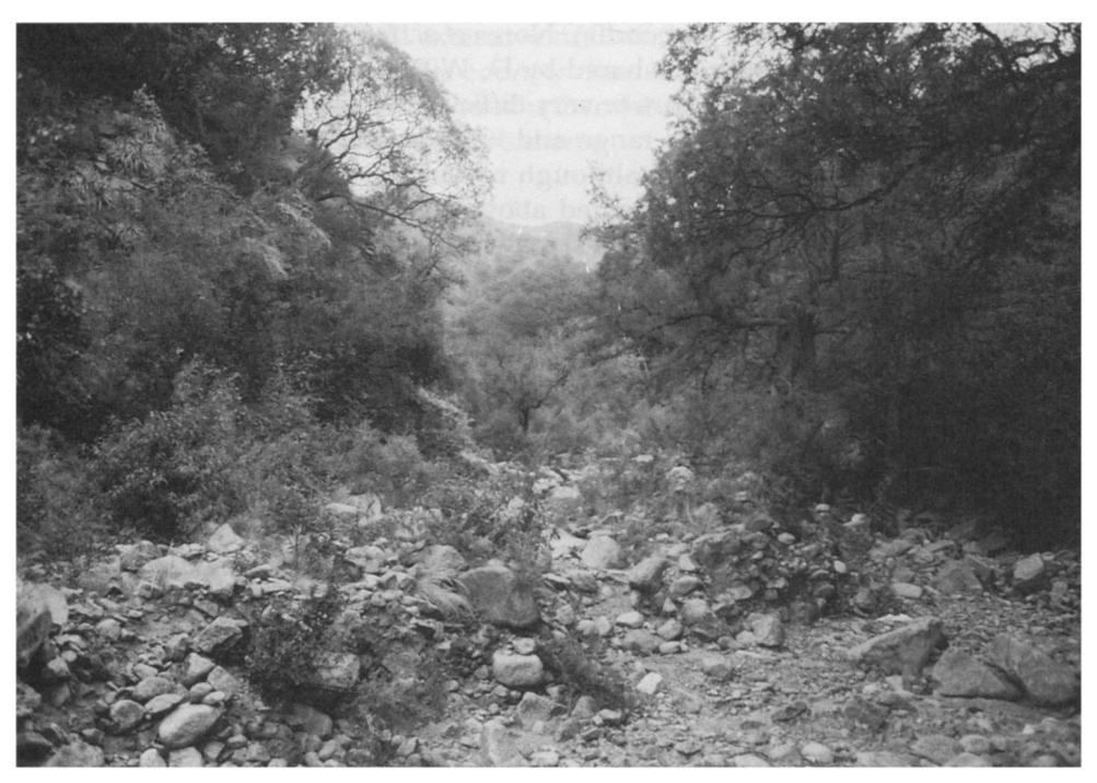
Figure 3. Transitional woodlands at Cerro Uritorco, Sierra Grande, Córdoba, Argentina, March 1991.

species has rarely been recorded in Formosa (two records); at Río Pilcomayo National Park birds were observed in an isolated woodland dominated by Prosopis sp. surrounded by marshland (park guard verbally to M.P.). Given that five of the seven other humid chaco records refer to hybrids (see Figure 1 and Appendix), it seems conceivable that the humid chaco is unusual habitat for the species, and further investigation on this hybridization zone needs to be conducted in order to shed more light about the status of the species there.