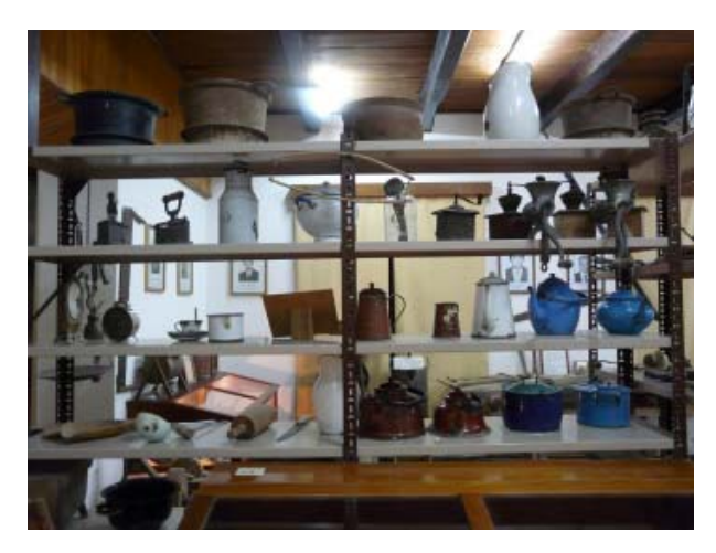
Fig 12. Everyday life: from porcelain to brass

The indigenous people, for their part, are represented by objects like axes, baskets,