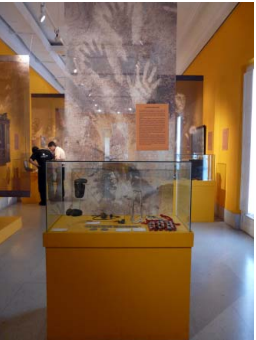
Fig 8. Transparent photographic screens: Cueva de las manos

the display. In the one on the right, the visitor retraces the history of Argentina from 1810 to 1976