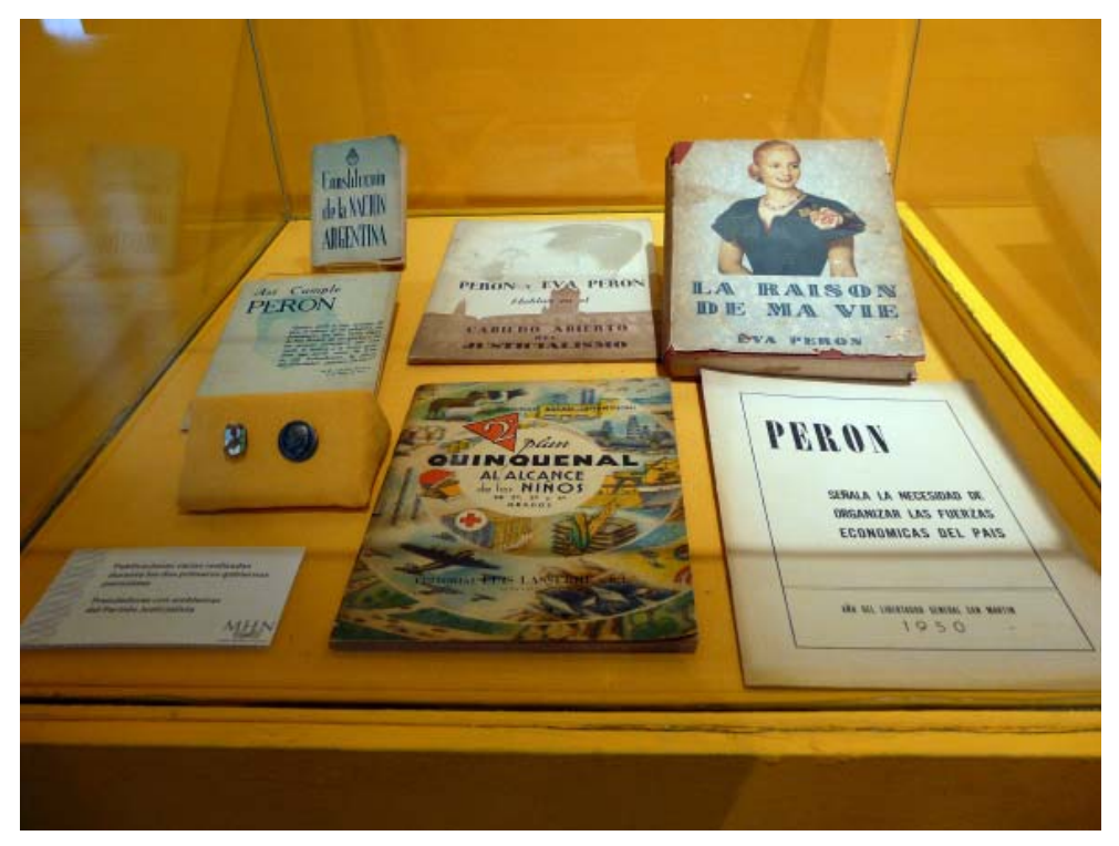
Fig 15. Peronism in the museum

Just as much could be said of the NHM and its proliferation of heroes and tombs. In spite of its attempts to create a critical display about the history of the nation, that desire is not reflected in the accounts of the exhibition, but in the statement of intent that precedes it. There is no single version of the past, the museum tells us. Yet this does not appear to be indicated in what is said in the collection, which wagers on reversing the traditional histories: where the great heroes used to be, now there are the popular masses. Here, the exhibition appeals to and dialogues with the more traditional versions of Argentine national identity asking: "Who are the Argentines?". Before the elitist notions that defined nationality as the legacy of high European culture, the new exhibition incorporates the great majority, that amalgam of immigrants and native population that represents the popular culture. Here, also, the inclusion of new subjects in the account or the reconsideration of its historical role makes the others into the opposition: the oligarchy and the military, of whom little is said – except that they are the root of the country's violence and political instability. The others are again an excuse to redefine one's own identity; in other words, they are merely a point of reference, against which the Argentines are to define