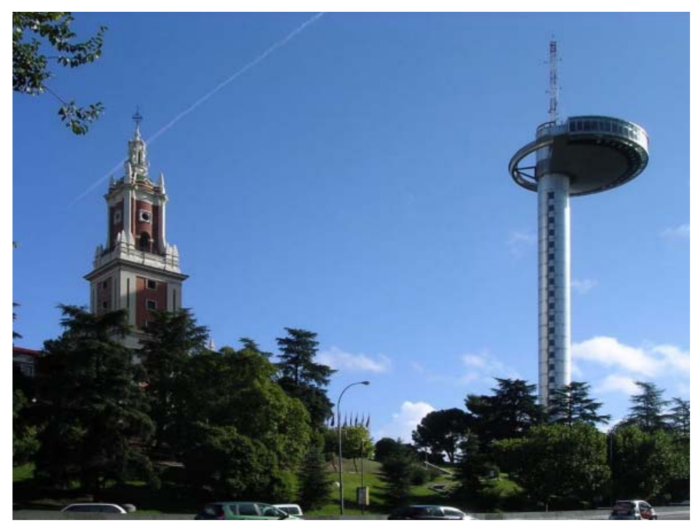
Fig 3. Tower of the Museum and 'Lighthouse of Moncloa'

repairs in 1981. It was not completely reopened until 1994, when it housed an entirely new exhibition that it has maintained since that time. The Museum of America opening its doors again in full democracy is one of the legacies of Franco. But the new government and the local authorities do not seem interested in re-drawing this cumbersome imperial historical legacy, which clearly extolled language and religion as Spanish contributions<sup>5</sup>. Moreover, the grand opening in 1994 was spatially related to the prior construction of a 92-meter tower called the 'Lighthouse of Moncloa', which "illumines the facilities that rise beneath its feet"<sup>6</sup>: that is, the Museum of America. The Lighthouse signals and marks what is locked away, the spoils of war obtained thanks to the Discovery and the Conquest, accentuating the colonial bias that we shall see in the exhibition itself.