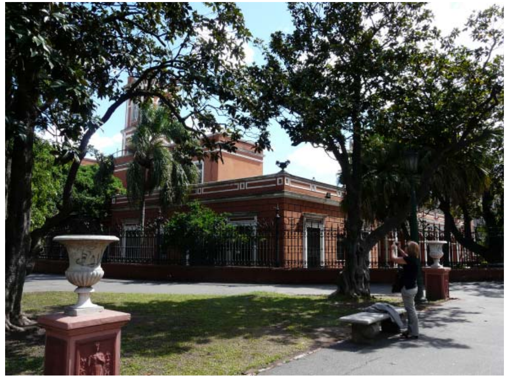
Fig 4. Outside the NHM