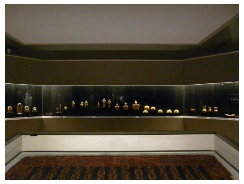
Fig 6. The Quimbayas Gold Treasure

graphically in the reproduction of a satellite map of the planet. Thanks to science and technology, Spain conquered America and, along the way, the museum allows us to "truly" know those realities. The second is a journey through Babel, from the variety and diversity of ethnicity, geography and culture, to the unity brought by the Spanish language, a tool of progress in the