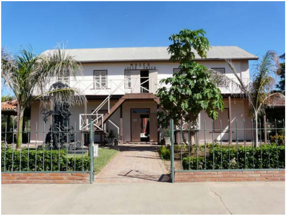
Fig 5. Jacob Unger Museum, Façade and main entrance in the intersection of the Hindenburg and Unruh Avenues.

It features two symmetrical apertures, one in front, and another in the back portion of the building. The one in the back leads to the gallery and a garden. At either side of the two doors are two windows, both on the upper and lower floors. The façade is split by an outside staircase that connects the front garden with the upper floor. The style of the building is an example of an architectural hybrid, with central European elements (materials, structure, roof design) and other characteristics from Paraguay (such as the corridor that circumambulates the entire building). The floor of the lower level, where the pioneer exhibit is kept, has been preserved with its original clay floors, and the structure of the building has been maintained nearly intact. Thus,