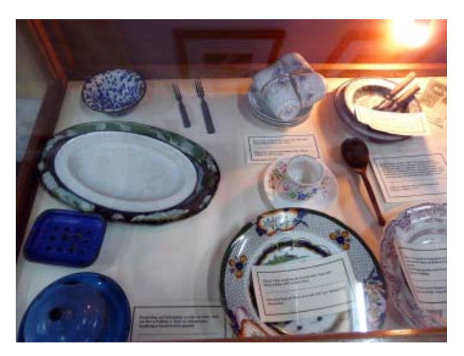
Fig 11. Porcelain dishes in the first display case

administrators throughout their history. The axis of everyday life has a peculiar structure, a certain language: from porcelain to brass. and from brass to iron. In the first display cases, which are kept under lock and key, are porcelain dishes and other personal effects which once belonged to people of a certain social status and cultural formation. The musical instruments accompanying this porcelain indicate that the pioneers were not poor farmers, but rather affluent agriculturalists who were obliged to emigrate, given the political situation in Russia. They brought porcelain to remember where they had come from, but had no reservation