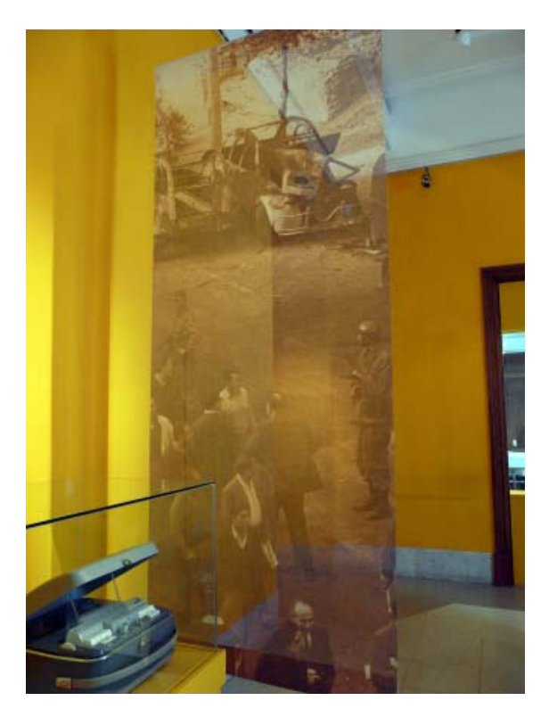
Fig 9. Violent intervention of guerrilla groups in the '70s

as the attention is focused on its heyday; but above all, the visitor sees Argentina's times of crisis. A critical look prevails over the violence in recent history, not over those exploits traditionally extolled by national patriotism, such as the British Invasions, The War with Paraguay, or the conflict in the Malvinas/Falkland Islands. It seeks to highlight the disastrous effects of these coups, because patriotic pedagogy for the Argentina of the 21st century is to promote democracy.