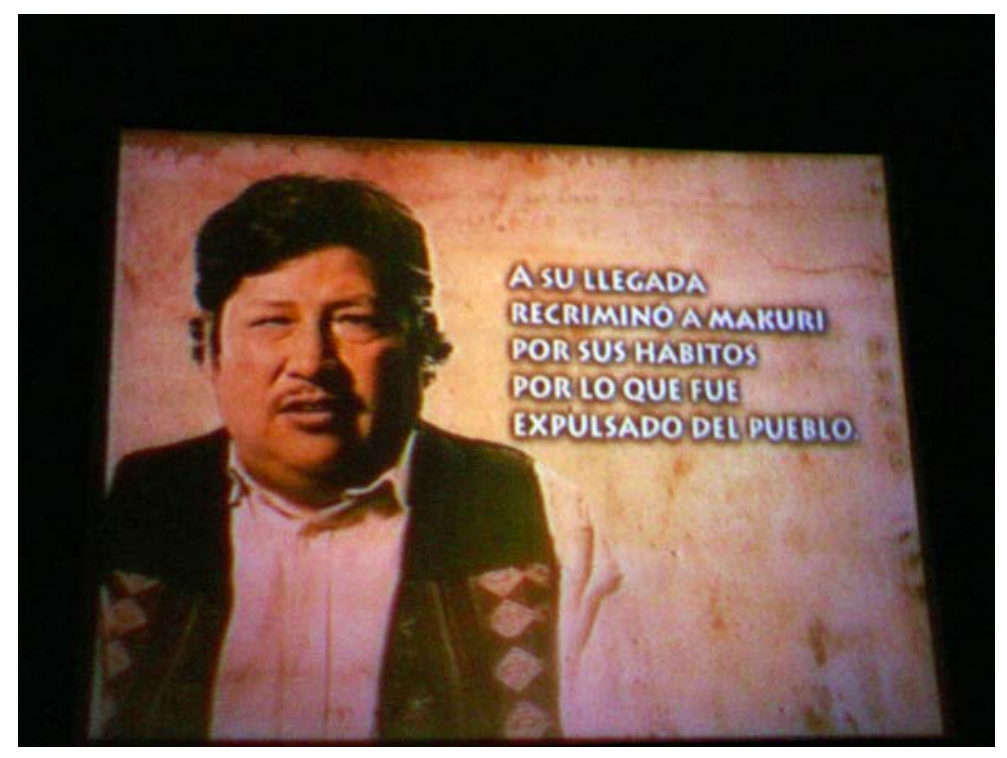
Fig 7. DVDs dedicated to indigenous languages

Different groups of human beings traveled along this road toward cultural and linguistic unity, and their demographic contributions are shown in the hall titled "The One Mankind."<sup>10</sup> There, Africans, Asians and Europeans are integrated into the American population with no problems, with the natural flow of an organized voyage. Nothing is said of the violence, power, submission, domination and resistance that took place among them (Price and Price 1995). Slavery, which is represented by the everyday objects of the African settlers, is called "African Emigration," and the rest of the panels in this hall seem to be a clear and deceptive attempt to show that the demographic catastrophe in Latin America was not produced through the Spanish Conquest, but rather during the wars of independence. In the same way, maps and charts hint that the conquest of North America was more traumatic, in demographic terms, than that of the rest of the continent, thus attempting to counter the "Black Legend", regarding the Spanish Conquest.