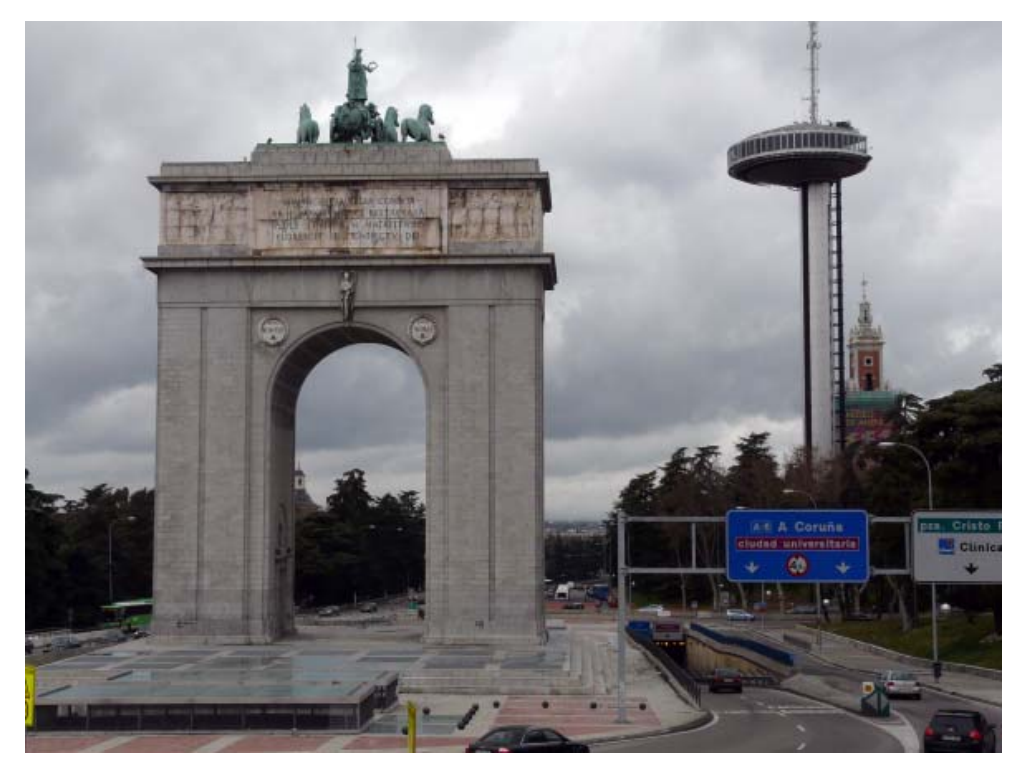
Fig 2. The Museum of America located at the intersection of the two main boulevards, with the Arch that commemorates the triumph of the fascist troops during Spanish Civil War.

of General Franco, two years after the end of the civil war. However, its collections wandered around other institutions until they were ultimately transferred to their current resting place in 1965. It is located at the intersection of two main boulevards, the Avenue of the Catholic Monarchs and Victory Arch Avenue, which ends a few meters away with an enormous arch that commemorates the triumph of the fascists troops in the war. The MAM is situated on a hill that demarcates Western Park, a verdant expanse where statues and monuments have been erected over the decades to heroic Latin American figures, and to the (Spanish) heroes who fought against the freedom fighters in Cuba and the Philippines.