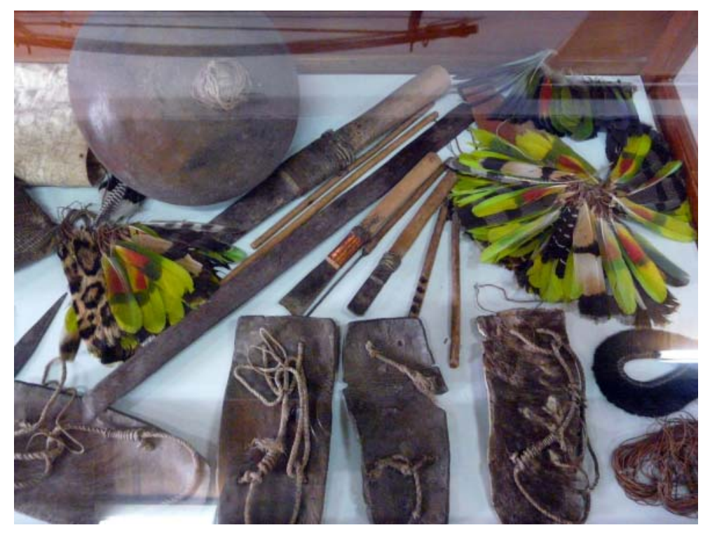
Fig 14. Indian textiles and feather adornments

that the colonists posed to the traditional Ayoreo lifestyle or the survival of their hunting grounds is never mentioned in the exhibition.