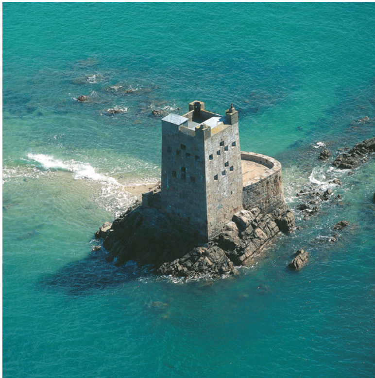
Figure 5 Seymour Tower, an eighteenth-century fortification near the Violet Bank, Channel Islands.

Matthew Pope received British Academy/Leverhulme Small Research Grant funding to lead an ambitious survey of a former Ice Age landscape, which sits in the English Channel seabed off the coast of Jersey (Figure 5). The project is also supported by Jersey Heritage and the Société Jersiaise.