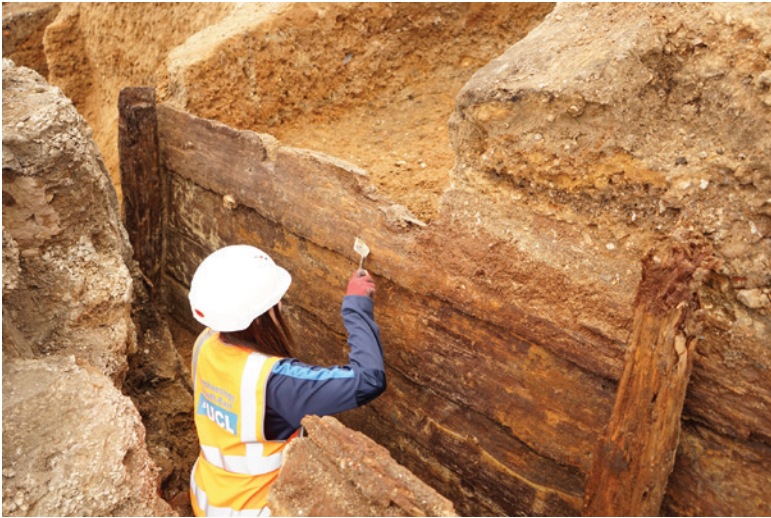
Figure 2 Archaeologists from ASE excavating the timber of the Elizabethan playhouse at Whitechapel.