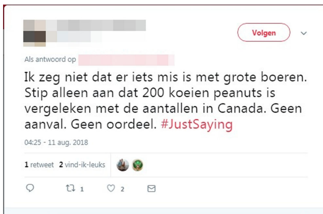
Figure 3. (response to @X and @Y): I’m not saying that something is wrong with large farms. Just pointing out that 200 cows are peanuts compared to the numbers in Canada. No attack. No judgment. #JustSaying.

While the author directly responds to two other participants (@X and @Y), her tweet receives a retweet and two likes from different Twitter users. This is important, for we see two separate lines of congregational work here: one line performed between the