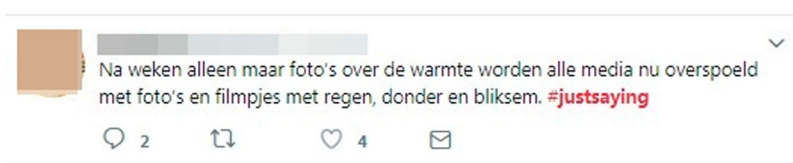
Figure 1. After weeks of only pictures about the heat, all media are now swamped with pictures and videos with rain, thunder and lightning. #justsaying.

The main point here is: such standalone tweets are, thus, framed in Goffman’s sense. They engage with existing ‘realms’ and select participants. And what they do within such meaningful units and in relation to ratified participants is to signal a particular footing: a self-initiated, detached, factual but critical, sometimes implicitly offensive statement not directly prompted by the statements of others and often proposed as the start of a series of responsive acts by addressees. They trigger and flag from within a recognisable