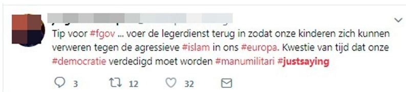
Figure 2. suggestion for #fgov ... reinstate national service to enable our children to defend themselves against the aggressive #islam in our #europe. Matter of time before our #democracy has to be defended #manumilitari #justsaying.