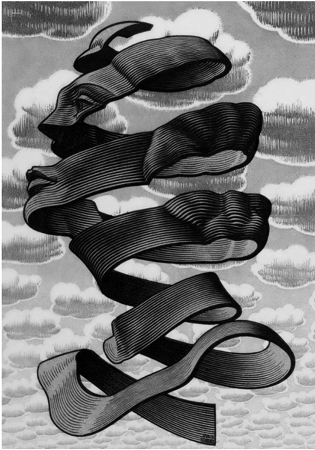
Figure 1: M.C. Escher's "Rind." Perhaps Escher was imagining the condition of unrenewed teachers—how sometimes they appear as if their effectiveness is at risk of unraveling. Self-renewal fosters an openmindedness to alternative interpretations, a susceptibility to new ways of seeing. Looking again at "Rind," is there something else you can see in Escher's imaginings?

experiences that will nurture the skills and attitudes that can enable each student to go beyond knowledge to expertise.