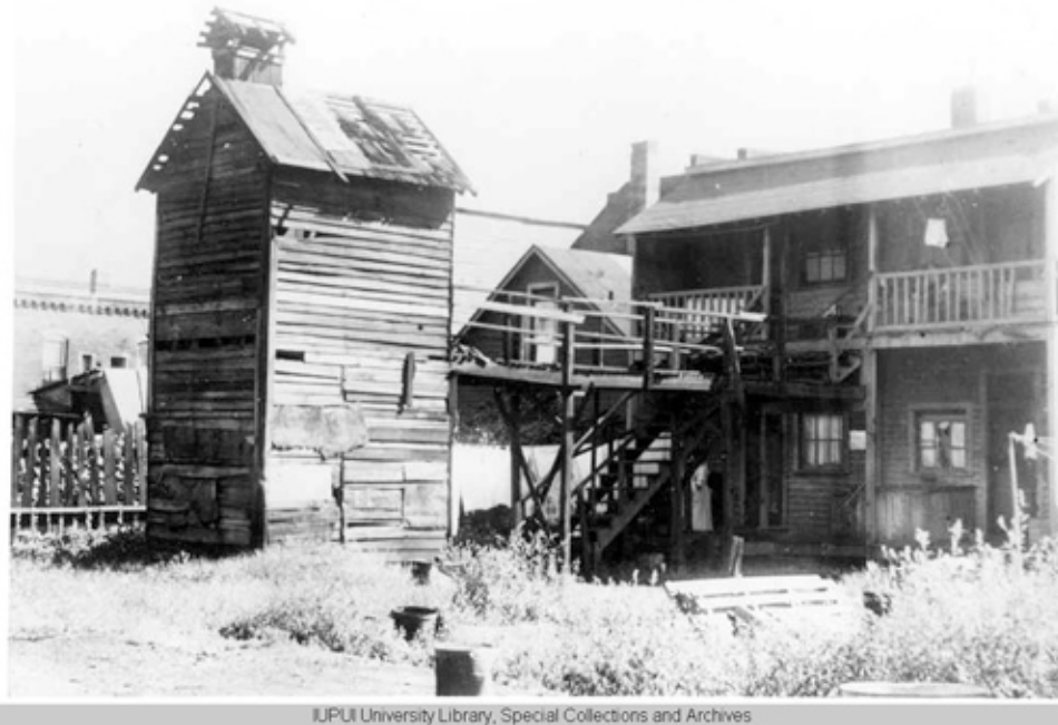
Many photos in the IUPUI Image Collection document development of the campus. Two-Story Outhouse on Campus Grounds, 1941.