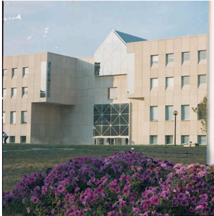
University Library Exterior View, 1995.

IUPUI Image Collection: A Usability Survey