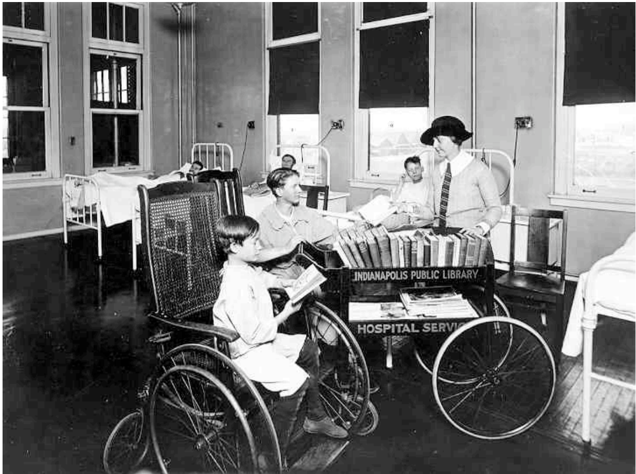
IUPUI University Library Special Collections and Archives

The IUPUI Image Collection provides online access to campus photos of historical interest. Indianapolis Public Library Hospital Service, ca. 1922. Copyright 2002-2004. The Trustees of Indiana University.