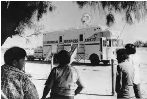
Figure 1 Exterior view of the mobile health unit on location