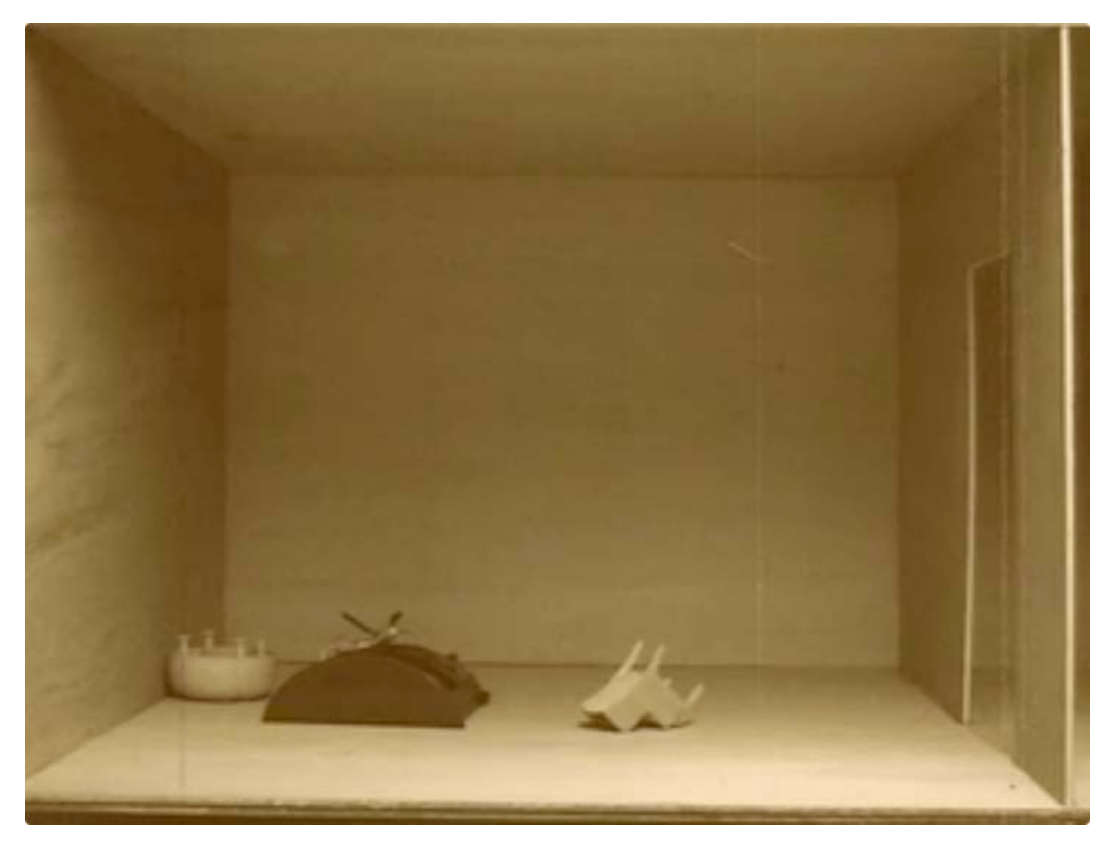
Fig. 2: still from Domain of Formlessness (2006), Alec Shepley

movies before the advent of digital technology. The pathos is accentuated by the sound track, a piece by jazz guitarist Django Reinhardt, which reinforces the connection with a more innocent viewing experience of the past.