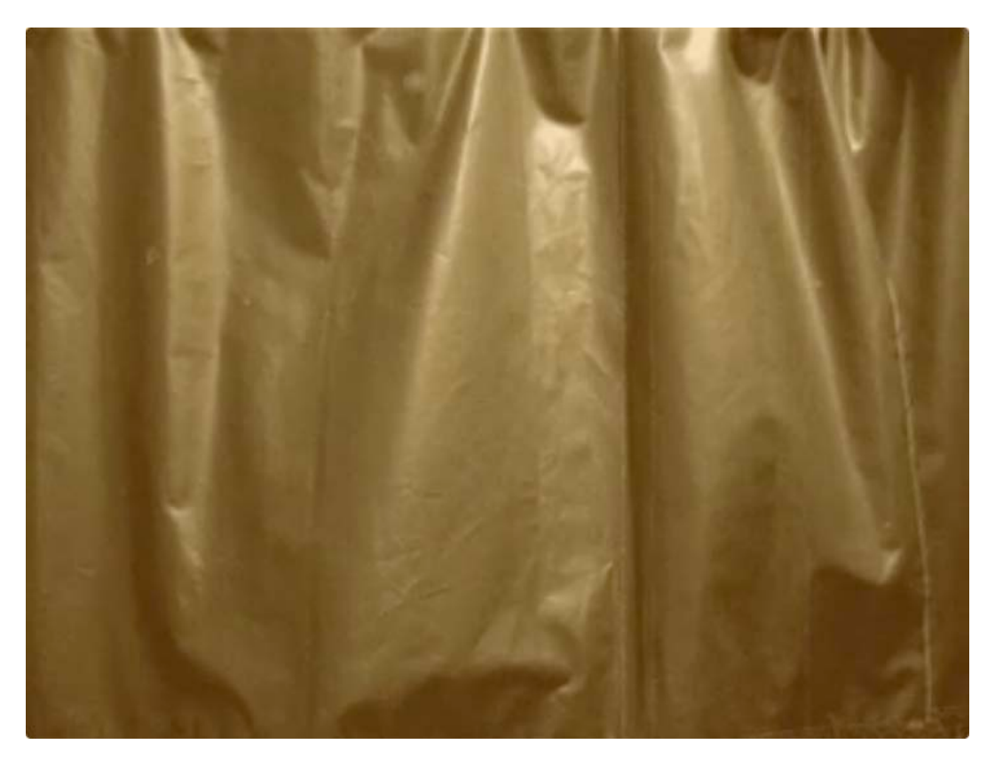
Fig. 5: still from Domain of Formlessness (2006), Alec Shepley

engage with or not, but a fundamental aspect of being. We tell stories to construct, maintain and repair our reality. When we were conceived, when the sperm met the egg, we were not there, but there is a second self-conception, which is our own. We conceive ourselves in our minds and then, through the speech act of our stories, we are born. The telling of stories is more than an individual process; through our stories we form relationships, our family stories bind us to those with whom we have shared experiences and our collective stories become our tribal, regional or national identity. These stories are performed and performative; they do not leave us unchanged but can in fact motivate us to act, to fight and be willing to die for an ideal or a belief.