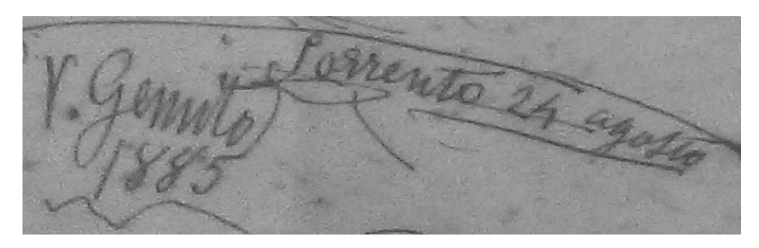
Figure 1. A long signature, with a large number of graphic features – possible categorical conclusions about its authenticity

signatures of this kind cannot be deemed useful in evaluating the authenticity of the work as a whole.