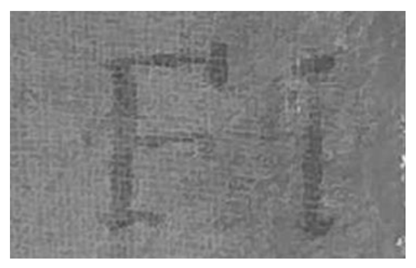
Fig. 4. Very short and simple form of signature with low dynamics – no basis to confirm or exclude authenticity (photo: Rijksmuseum. Available online at <a href="https://www.rijksmuseum.nl/en/rijksstudio/artists/frans-hals">https://www.rijksmuseum.nl/en/rijksstudio/artists/frans-hals</a>. Accessed on October 27, 2017).