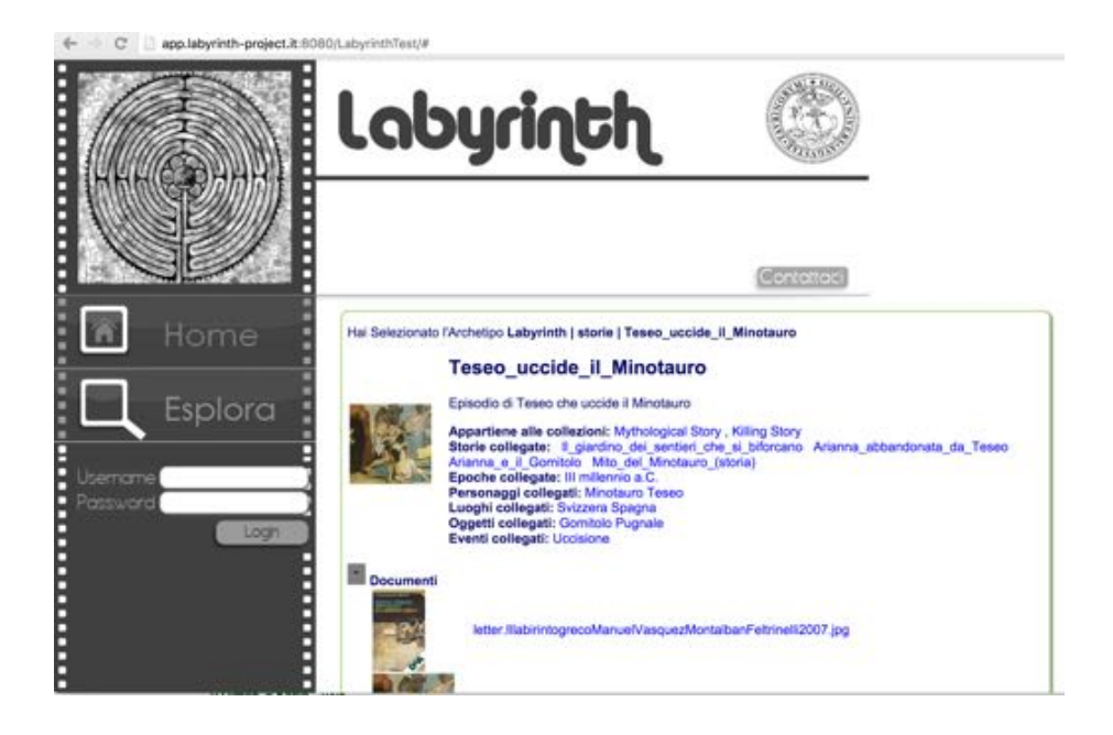
Figure 1: A screenshot of the web interface of the system (in Italian).

The archetypes are contained in an ontology that describes each archetype in terms of its related stories, characters, objects, events, and locations, and stores the connections that relate these categories with the items in the repository.