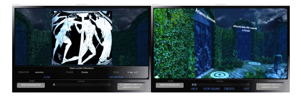
Figure 5: Third step of the navigation: a Greek vase representing Thesues killing the Minotaur (left); doors leading to the artworks referring to the same story (right).

(Fig. 3, left). The first location is the node containing the start artwork, the painting entitled "Minotauromachia" by Pablo Picasso, which shows the Greek hero Theseus fighting with a Minotaur. Fig. 3 (left) shows how the artwork (here, a picture of the painting) is displayed to the user in a 2D layer temporarily superimposed to the 3D scene; the artwork is accompanied by the information about its author, the place where it is hosted and the creation date. A longer description can be obtained by clicking on "description", below the image; by clicking on "close", the layer disappears. Figure 3 (right) shows some of the connections available from the node, represented by the two doors labeled as "agent" and "story" (other doors are out of the view): the first door leads to artworks that feature the same character (named "agent" in the system) as the current artwork, the second door leads to artworks that relate to the same story.