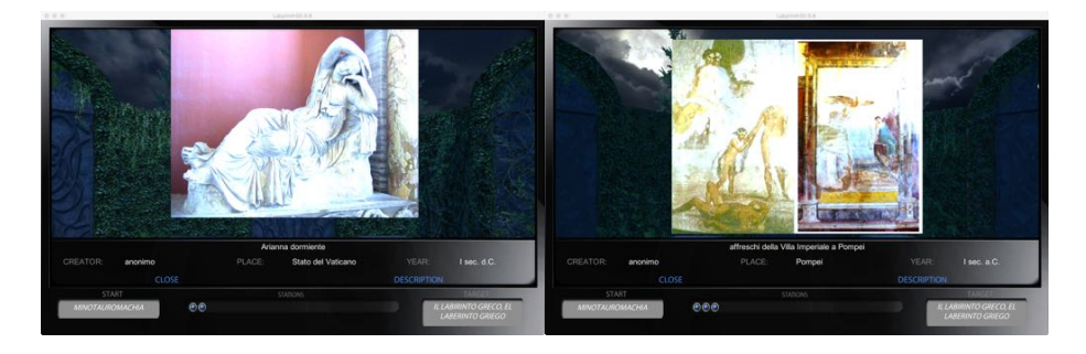
Figure 6: Left: fourth step of the navigation, a statue of Ariadne (same story relation); a different artwork (right), reachable by backtracking to the previous step (a Roman fresco representing the myth of the Minotaur in Pompei).

is led to a node that contains a Greek vase displaying the Theseus in the act of killing the Minotaur (Fig. 5, left). Notice that the console posited in the bottom part of the interface contains, besides the controls for getting help, stopping the sound and exiting the application, a progress bar displaying the artworks visited by the user so far: by selecting a previously visited artwork, the user is brought back to the node containing it. After the Greek vase, the user follows the same story relation by clicking on the door labeled as "story" (not shown), and is brought to an empty node with doors for the artworks that refer to the same story: "Arianna dormiente" ("Sleeping Ariadne") and "Affreschi della villa imperiale a Pompei" ("Frescos, Villa Imperiale in Pompei": notice that, like in a true labyrinth, the same artwork can be gained by following different paths). By choosing the first door, "Arianna dormiente" ("Sleeping Ariadne"), the user will reach a node containing a Roman statue of Ariadne, the female character of the myth of the Minotaur (Fig. 6, left); from there, by backtracking to the previous node, the user may select the second door, "Affreschi della villa imperiale a Pompei" ("Frescos, Villa Imperiale in Pompei"), which leads to a node containing a painting that illustrates the myth of the Minotaur, located in a Roman villa in archaeological site of Pompei (Fig. 6, right).