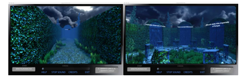
Figure 4: Second step of the navigation: a pathway (left) to the subsequent artwork; second artwork (right), with doors leading to the other artworks in the "same character" relation.