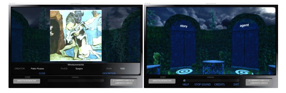
Figure 3: First step of the navigation: the initial artwork, Minotauromachia (left); right: some of the doors available from the initial artwork (same character and same story).

A slide show of the thumbnails is positioned on the left of the story record to provide a quick glance on the available contents for the current selection.