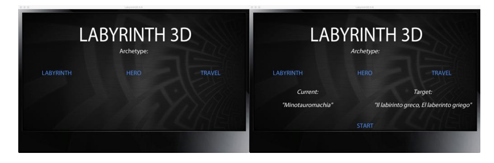
Figure 2: 3D interface: selection of the archetype (left) and assignment of initial and target artworks (right, labeled as "current" and "target").