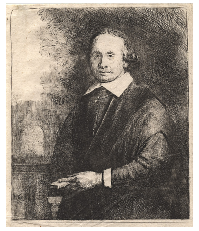
Figure 2. An impression (etching) by Rembrandt of the physician Jan Antonides van der Linden.