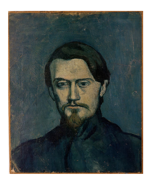
Fig. 9 Pablo Picasso, Portrait of Mateu Fernández de Soto ,1901, oil on canvas, 46×38 cm, Private collection © Bridgeman Images, © Pablo Picasso's Estate. VEGAP. Madrid, 2020. Permission to reproduce courtesy of VEGAP

be seen through surface cracks on the painting, and the reversed letters "sid" of the word "président" could be seen on the Mother's face. Physical evidence of newspaper has not been detected. Interestingly, the reversed newsprint