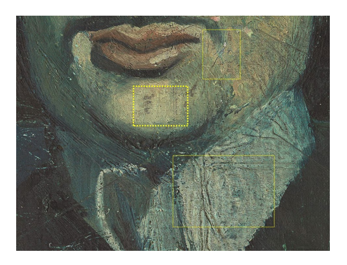
Fig. 10 Detail of Jaume Sabartés with Pince-Nez © Pablo Picasso's Estate. VEGAP. Madrid, 2020. Permission to reproduce courtesy of VEGAP

letters seemed to be only from one side of the newspaper page.