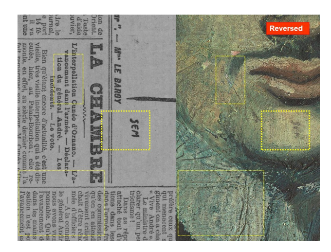
Fig. 11 [Left]: Le Journal, January 18, 1902, page 2, Bibliothèque nationale de France, Source gallica.bnf.fr/BnF, [Right]: Reversed detail of Jaume Sabartés with Pince-Nez © Pablo Picasso's Estate. VEGAP. Madrid, 2020. Permission to reproduce courtesy of VEGAP