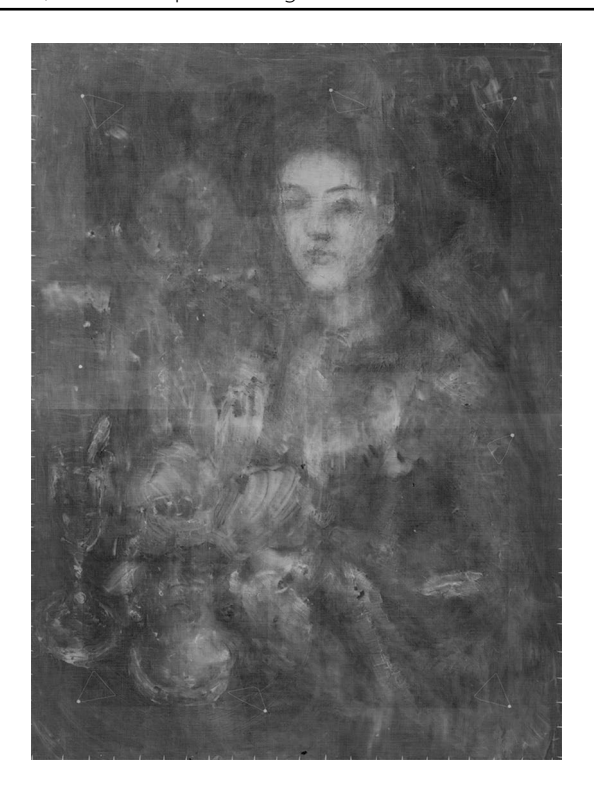
Fig. 2 X-ray radiograph, Mother and Child by the Sea

The condition of Mother and Child by the Sea is as it was at the time of the Pola acquisition, including the presence of a linen backing. Recent inspection shows there are traces of restoration and a surface coat of varnish. The painting surface appears uneven, even to the naked eye, and unrelated texture suggests a composition beneath the surface. Three optical surveys on Mother and Child by the Sea have been done. The first was in 1997 by Ms. Ann Hoenigswald of the National Gallery of Art, Washington DC, who took an X-ray radiograph and infrared photos at the time of the Picasso: The Early Years exhibition at the National Gallery of Art, Washington, DC and the Museum of Fine Arts, Boston.