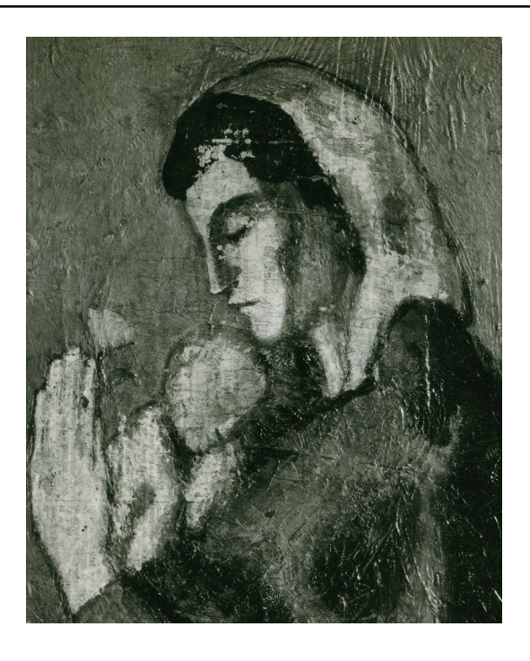
Fig. 15 Mother and Child by the Sea, detail of photo by Francesc Serra i Dimas, n.d., Courtesy of Mr. Francesc Fontbona © Pablo Picasso's Estate. VEGAP. Madrid, 2020. Permission to reproduce courtesy of VEGAP

The irregular condition of the newsprint letters in Mother and Child by the Sea and Portrait of Mateu Fernández de Soto suggests that the newspaper applied to Portrait of Mateu Fernández de Soto was creased or wrinkled and