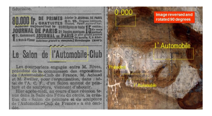
Fig. 4 [Left]: Le Journal , January 18, 1902, page 3, Bibliothèque nationale de France, Source gallica.bnf.fr/BnF, [Right]: Reversed detail of Infrared false color image of Mother and Child by the Sea © John K. Delaney, National Gallery of Art, Washington, DC 2018

visualization of earlier painted compositions in Blue Period paintings by Picasso [6]. A large number of hyperspectral near-infrared reflectance image cubes were collected and mosaicked together to create one large image cube from which false color images were created to make the newsprint letters clearer to see.<sup>2</sup> Near-infrared reflectance imaging spectroscopy often provides complementary information to X-ray radiography since it is sensitive to infrared absorbing pigments not detected by X-ray radiography.