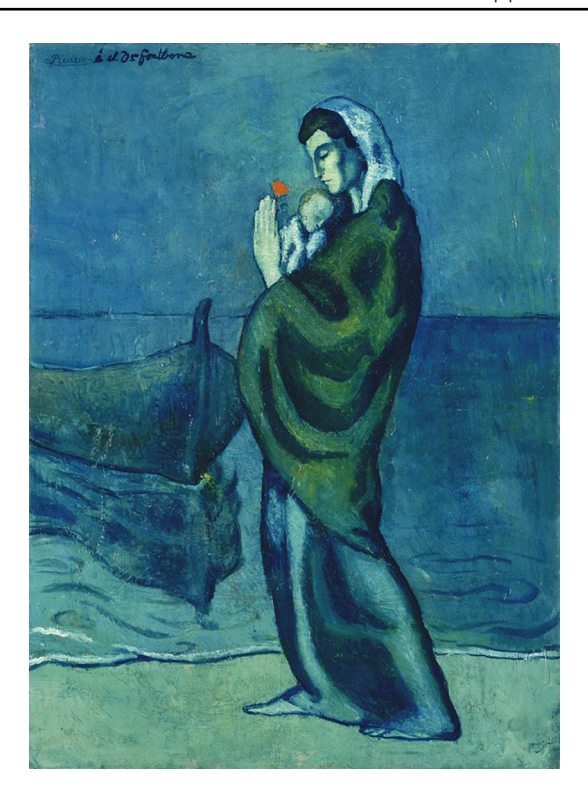
Fig. 1 Pablo Picasso, Mother and Child by the Sea, 1902, oil on canvas, 81.7 \times 59.8 cm, Pola Museum of Art, Hakone

Mother and Child by the Sea is thought to have been completed in Barcelona in January 1902. It may be the Barcelona coast seen in the background. The Fontbona family let go of the painting in 1957, after which it appeared in auctions and changed hands among different collectors. Tsuneshi Suzuki (1930–2000), owner of the Pola-Orbis Group and an avid collector, acquired the painting in the 1980s. His collection opened to the public in 2002, with the establishment of the Pola Museum of Art.