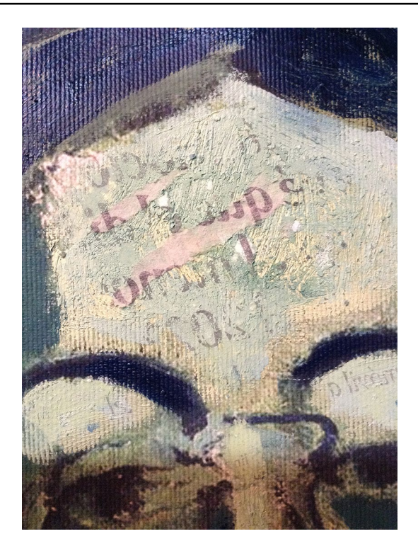
Fig. 14 Simulation of the transfer of newspaper letters on to a painted copy of Jaume Sabartés with Pince-Nez by Reyes Jiménez Garnica, oil on canvas, 2018

Picasso once tried to give Jaume Sabartés with Pince-Nez to Sabartés' family but finally he decided kept it for himself. He also kept Portrait of Mateu Fernández de Soto for himself for the rest of his life.<sup>9</sup>