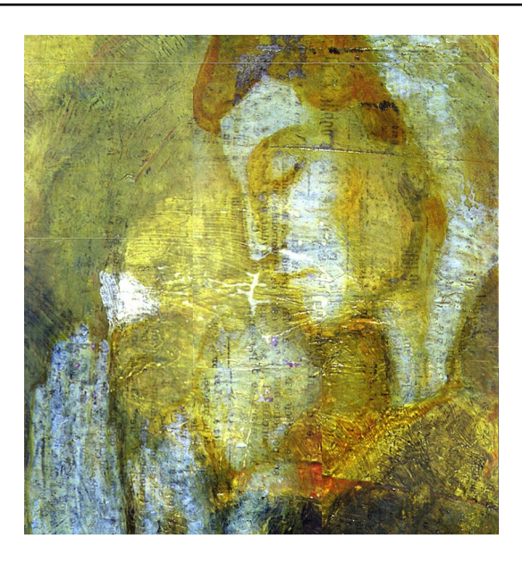
Fig. 3 Detail of Infrared false color image of Mother and Child by the Sea

visualization of earlier painted compositions in Blue Period paintings by Picasso [6]. A large number of hyperspectral near-infrared reflectance image cubes were collected and mosaicked together to create one large image cube from which false color images were created to make the newsprint letters clearer to see.<sup>2</sup> Near-infrared reflectance imaging spectroscopy often provides complementary information to X-ray radiography since it is sensitive to infrared absorbing pigments not detected by X-ray radiography.