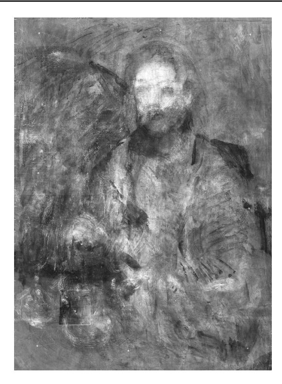
Fig. 6 Composite image of principal component analysis of infrared hyperspectral imaging and X-ray radiograph of Mother and Child by the Sea

were identified as being from page 8 of the January 18th edition of Le Journal (Fig. 5).