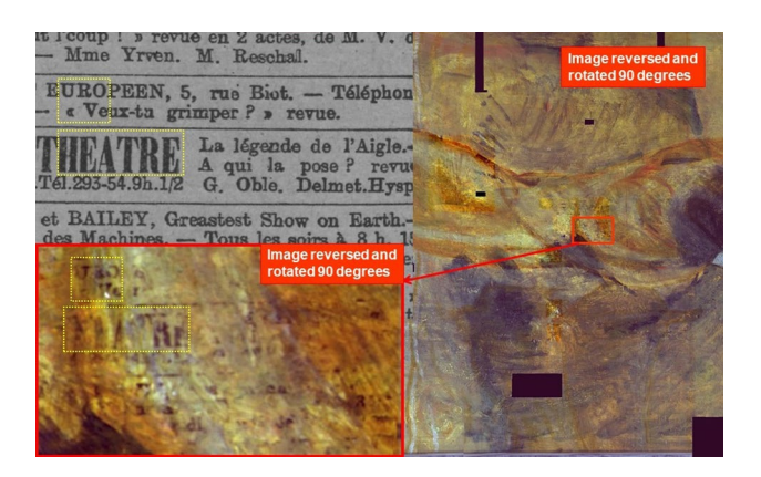
Fig. 5 [Left]: Le Journal, January 18, 1902, page 8, Bibliothèque nationale de France, Source gallica.bnf.fr/BnF, [Right]: Reversed details of Infrared false color image of Mother and Child by the Sea © John K. Delaney, National Gallery of Art, Washington, DC 2018