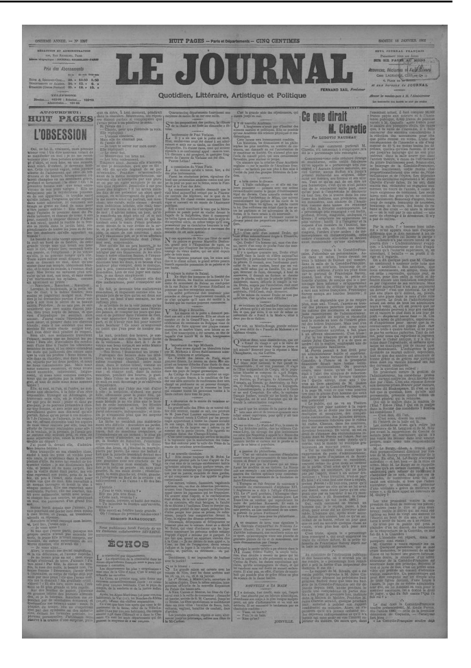
Fig. 7 Le Journal, front page, January 18, 1902, Bibliothèque nationale de France, Source gallica.bnf.fr/BnF

According to the findings of our hyperspectral nearinfrared reflectance imaging survey, the newsprint is from a January 18, 1902 French newspaper (Fig. 7). This strongly supports the theory that Picasso moved to Barcelona in the latter half of January. Prior to the newsprint discovery, it was thought that Picasso moved to Barcelona in early January, according to Picasso's friend Sabartés [10].<sup>4</sup>