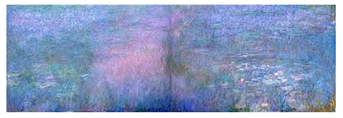
Figure 3. Claude Monet Stagno di ninfee, 1915–1926, Chichu Art Museum, Naoshima, Kagawa.