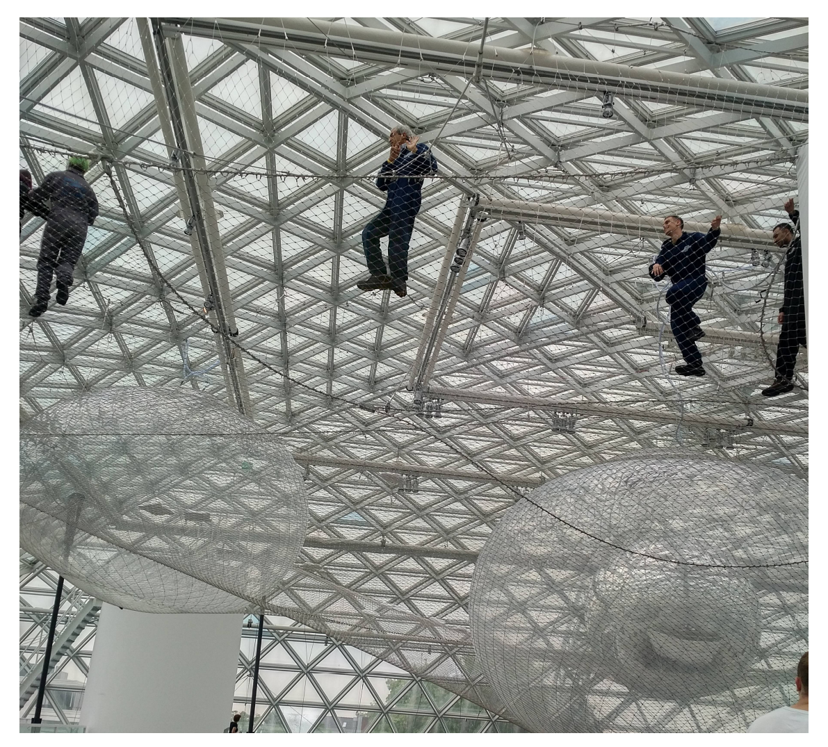
Figure 1. Picture of the author visiting In Orbit —2017 tempoarary exhibit of Tomás Saraceno in Standenhaus, Kunstsammlung Nordrhein-Westfalen, Düsseldorf.

All of what follows is basically notes that intersect with the various techniques, to be collected and developed (Figure 1).