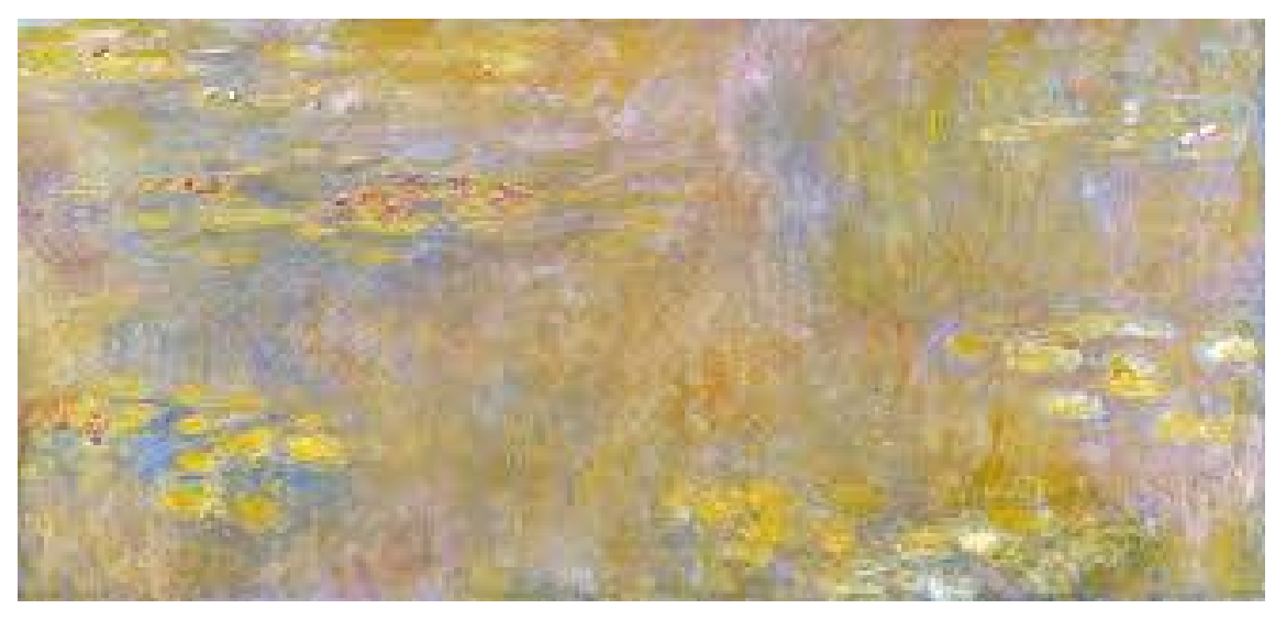
Figure 2. Claude Monet Ninfee, 1920, National Gallery, London.

• Cézanne says, "the instant the paint becomes a gesture, the painter thinks in paint".