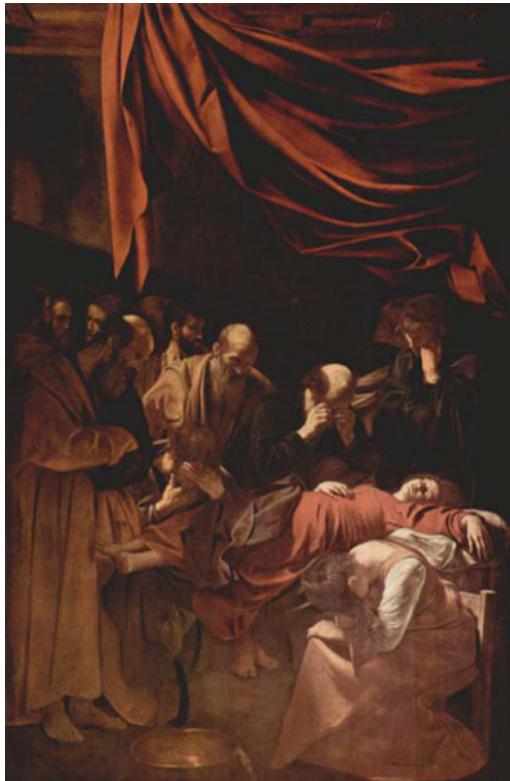
Figure 2. Death of the Virgin (Caravaggio, 1606). The work of art depicted in this image and the reproduction thereof are in the public domain worldwide.

Certain artists have fascinated the class members. Caravaggio, the pioneer Baroque painter, painted real people in action, with dirty fingernails and all, to depict bible stories for Catholic churches. Some of his work was rejected by church leaders, because his subjects did not look saintly enough. Figure 2 illustrates the down-to-earth style of this early Baroque painter (Caravaggio, 1606). The veterans were interested in Caravaggio's life struggles, stemming from the loss of most of his family to bubonic plague. Learning about how famous artists endured their life difficulties has been part of teaching the veterans about resilience and recovery – how to endure great troubles and still move forward with their lives.