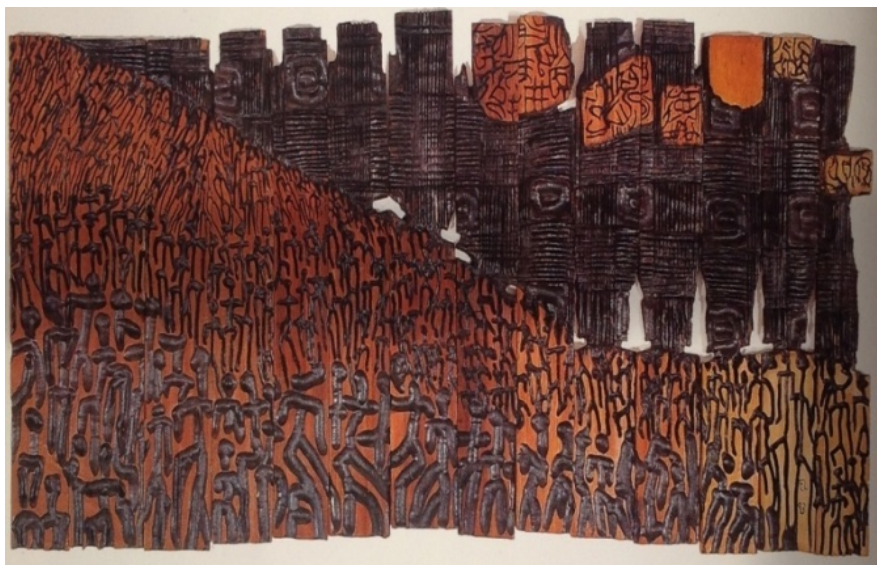
Fig. 2 El Anatsui, (1993) Mammoth Crowd. Series 1