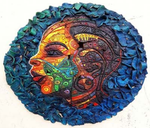
Fig 5 Chuks Chukzmore, Black is Beautiful , Acrylic

The traditional bullet proofs, e.g. the Benin or Idah Soldier with "Coat of Mail" , as shown in Fig. 7, is made entirely of metals or shells of resilient nuts. So either way, it could be metal or wood sculpture. This is not the case with El Anatsui's logoligi or Society Woman's Cloth .