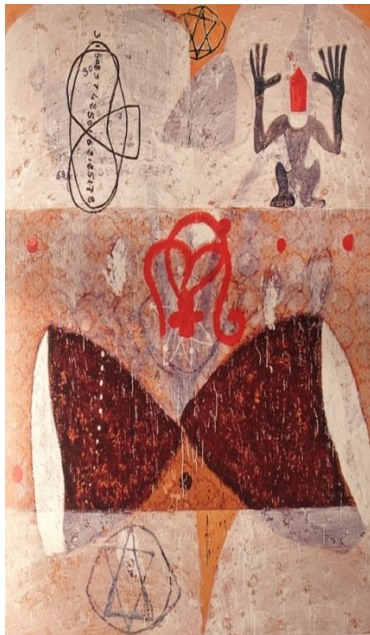
Fig. 4 Uttara Bakary, Untitled

protruding forms achieved with new unconventional paint media as indicated in Fig. 5.