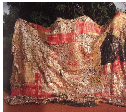
Fig. 7 El Anatsui, Society Woman's Cloth