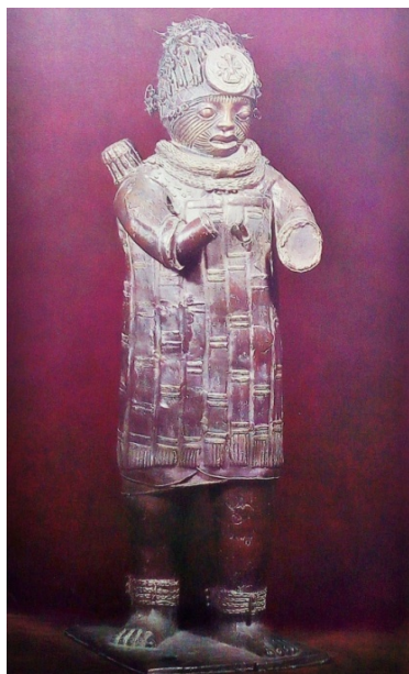
Fig. 8 Nupe Warrior with Coat of Mail

it for many years before we discovered the practice in an interview with him in 2005. This same artist constructed bellows from water pump for improvement of local furnace firing and used it for many years of his studio practice without formal documentation