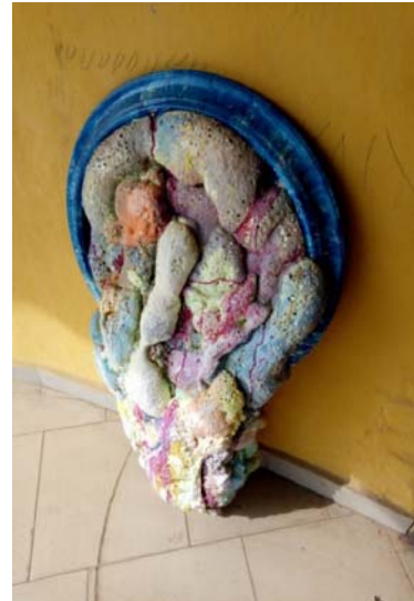
Fig. 6 Bolaji Ogunwo, (2018) Spill , Acrylic, Polyhol

Western, defined ceramic floor tiles are not rejected when broken. They are simply re-used in a stylized way even to satisfy the same preservative and decorative desires of an unbroken one.