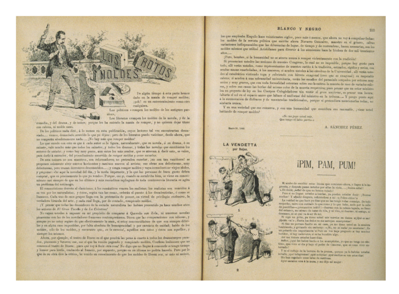
Figure 1. Blanco y Negro, 48. Madrid, 3 April 1892.

In all cases, we know that Picasso's interest in the illustrated press arose from his own curiosity about this type of graphic information and is documented, as recalled by Ventureira and Pardo [7] and Baldassari [15] by the presence in the archives of various issues of the magazines Monde Illustré , from 1880, La Ilustración , from 1890, further copies of the Barcelona magazine Un tros de paper , from 1865, and of course the one that most strongly influenced the examples we are concerned with here, from its modernist standpoint, the Madrid magazine Blanco y Negro , which began publication in 1890. It is quite clear, then, that in the A Coruña newspapers the impact of Blanco y Negro (Figure 1)—which his father read ([7], p. 91)—is the most obvious on the basis of its graphic codes and treatment of news, which the child cleverly tried to imitate ([16], p. 10).<sup>4</sup>