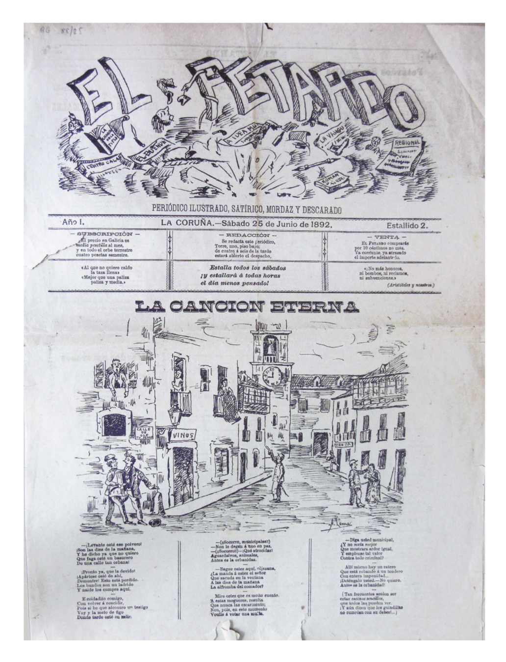
Figure 3. El Petardo, 25 July 1892. Printed magazine. 40.5 \times 30 cm, Real Academia Gallega, A Coruña.

More than the consolidation of a specific style, the previously mentioned characteristics tells us, through an analysis of his "little newspapers", that the adolescent Ruiz Picasso engaged with the way of thinking of the city and into many of its customs and commonplaces, how he interprets it with humour, but above all how he reproduces a distinctive sociology of fin-de-siècle Galicia, between the weight of the rural and provincial and an urban desire to emerge, looking at the world from the fragmented metonymy of that Coruña which defended the Athenian slogan that no one was a foreigner in the city. Here we can find the seed and the graphic expression of the critical and social rather than political consciousness of the teenager, in line with what Jean-Pierre Jouffroy argues ("Debemos señalar, en primer lugar, que los dibujos de juventud publicados tanto en la prensa española como francesa se refieren más a la crítica social y no a las relaciones directas con la política" [we should point out, first of all, that the juvenile drawings published in the Spanish and French press refer more to social