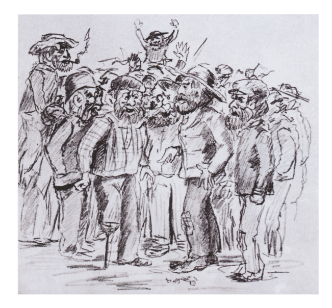
Figure 4. Pablo Picasso, Congreso de anarquistas , ca. 1893. Reproduced with permission from the Real Academia Gallega, El primer Picasso. A Coruña 2015; A Coruña: Museo de Bellas Artes, 2015, p. 205.

What is more surprising is the late appearance of his more political or ideological caricatures, dated around 1892 and 1893, like Congreso de anarquistas <sup>37</sup> (Figure 4), only reproduced many years later in art journals, taking advantage of Picasso's prestige. The group portrait of the anarchists rebelling has all the ingredients of the satirical drawing, here reinforced by the expressionist lines and a psychological study of the faces of the characters in the foreground, which reveal the precocious maturity of the young artist, able to portray the inner strength of those trade unionists in political and aesthetic terms.