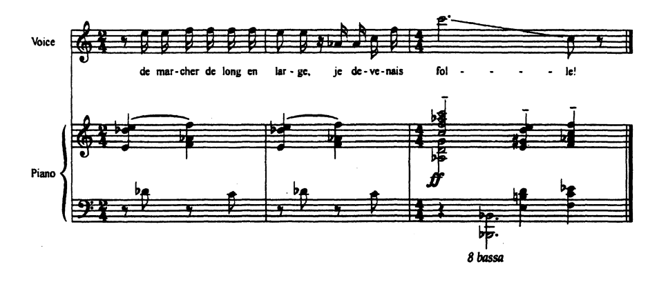
Example 5. La Voix humaine, bars 388-90

in Voix evoke an extended version of the mad scene from Lucia di Lammermoor, long considered the archetypical example of madness in opera. In Voix, the telephone—and even the telephone cord—become agents of her eccentric, campy hysteria, as she walks around the small apartment holding the phone and caressing the phone cord as if it were "II." The device becomes a surrogate for the lover who, as in Lucia, is absent from the scene. Later, the cord becomes an agent of escape as she begins to wrap it around her neck, a final attempt to win his sympathies and to restore their bond. Even this ploy fails. In several parts of the score, the unstable vocal line shows her on the brink of madness and hysteria, especially when she declares that waiting for him had caused her to temporarily lose her sanity. Here, she ascends to a high C, the top note in the entire score, as one further attempt to attract his attention. The score as a whole is peppered with disjunct vocal fragments that personify her growing anxiety (example 5).