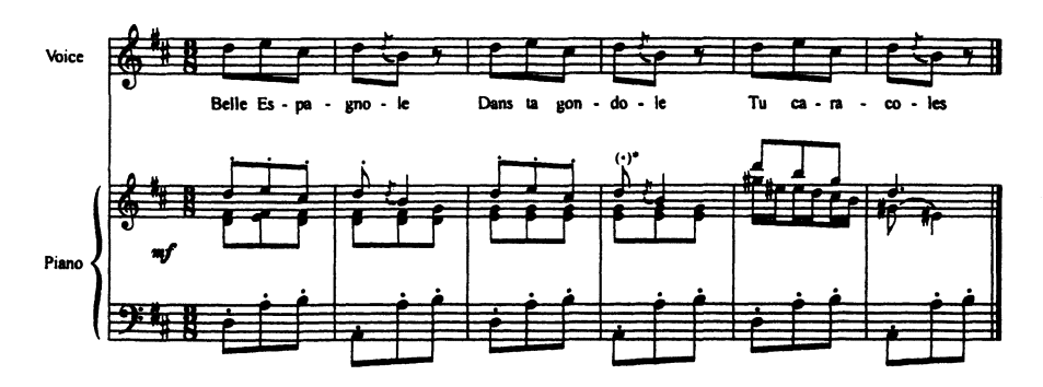
Example 4. Toréador, bars 88-94

word, as in "Espagnole" below (example 4). Toréador is a potent example of Sontag's division between "naive camp" and "deliberate camp."<sup>23</sup> Because of its exaggerated style, the song would fall into the latter category. Works that become campy without trying to be are examples of the former, and La Voix humaine clearly fits that mold.