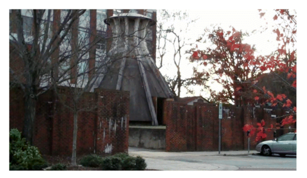
Fig. 8. Student caption: "I can't help but think that the tower thing [cooling tower] could be taken down. Also, to make this place seem less sketchy, maybe there can be paintings or flowers."