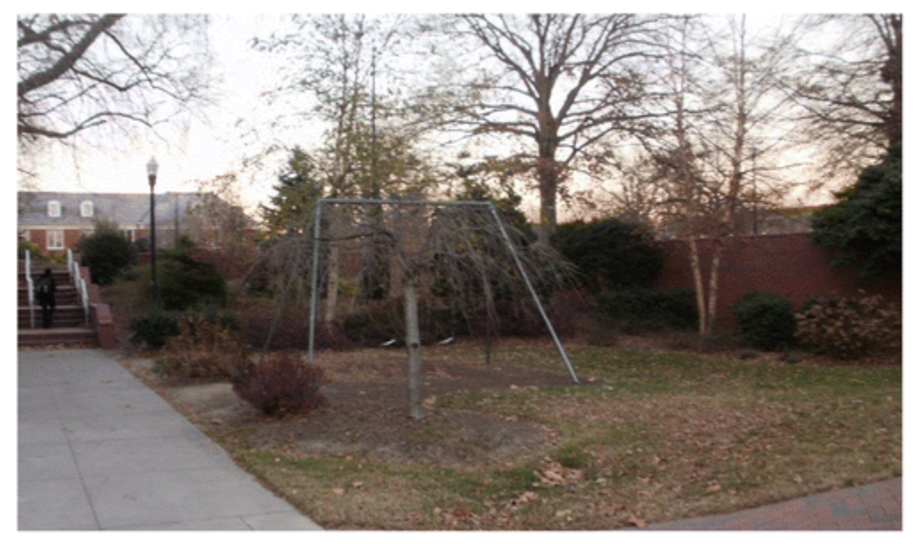
Fig. 1. Student caption: "This is a great place to take a mental break from your classes. This area is located away from some of the busier areas of campus so you can enjoy your surroundings. The swings are a nice way to enjoy the fresh breeze in your face or just enjoy a slower pace."

Photos and captions in the Swings theme described a popular spot on campus nestled between the library and the student union building that contained a small swing set (Fig. 1). A variety of trees and shrubs surrounded the swing set area, giving students an opportunity to alleviate stress by swinging in green space. For many students, the swing set had become a campus staple. One student wrote in a caption about the swing set, "This is my go-to area to unwind and not think about responsibility for about an hour."