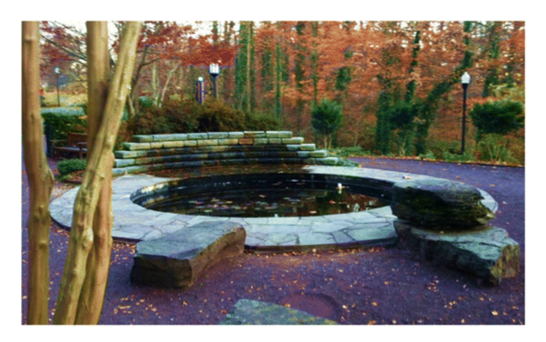
Fig. 4. Student caption: "This fountain is located outside the music building and provides students with a relaxing, peaceful atmosphere. There is limited traffic around the area, as it is secluded from the main buildings on campus. It is quiet and surrounded by trees, flowers, and shrubbery where students can enjoy the nature and the calming sound of the fountain. There are rocks and benches surrounding the fountain where I like to come and sit when I have free time on campus."

The Salad Bowl theme included photos of an on-campus park. The center of the park was lower in elevation than its perimeter, giving it a bowl-like appearance. The park contained a wide variety of trees and plants, giving the plant life an appearance of "salad" inside a bowl. "Salad Bowl" has been an endearing term used by students for decades when referring to the park. Photos and captions regarding the Salad Bowl described the area as a place for students to study, relax, or walk through on the way to class (Fig. 5). Students enjoyed the presence of the trees for shade, the changing leaves, and the opportunity to spend time in nature. A few students wrote that they enjoyed passing through the park when going to or from class because the area gave them a brief moment to calm down. One student wrote that the Salad Bowl had "been a faithful friend for the past five years."