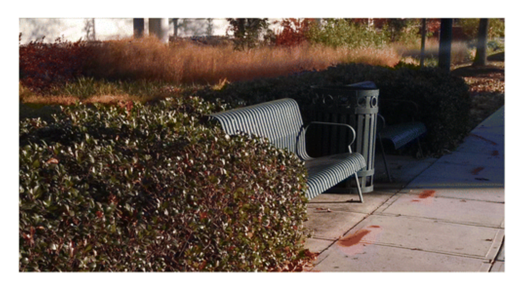
Fig. 7. Student caption: "These park benches are all throughout campus. The only drawback is that when I sit on these benches I don't want to be able to smell the trash cans next to them. Also, during the spring and summer, the bees and yellow jackets love to fly around the smelly trash cans. I would love to sit in these benches between classes but don't want to come away stung or smelling. One way to improve this is to move the trash cans away from the benches so that the smell and the bugs aren't swarming around."