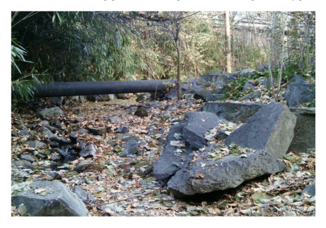
Fig. 3. Student caption: "This spot is located in Peabody Park beneath the bridge leading to the music building. This is a particularly interesting rock as it provides a seat for people to sit and observe nature. This is a great place to unwind after a stressful day and listen to the sounds of birds chirping, water flowing, and leaves moving in the wind."

that was beneficial for relieving stress (Fig. 3), a few students took photos of litter and exposed drainage pipes. The students made recommendations in their captions that the park be better maintained and that the pipes be covered up with earth-toned paint or ivy plants.