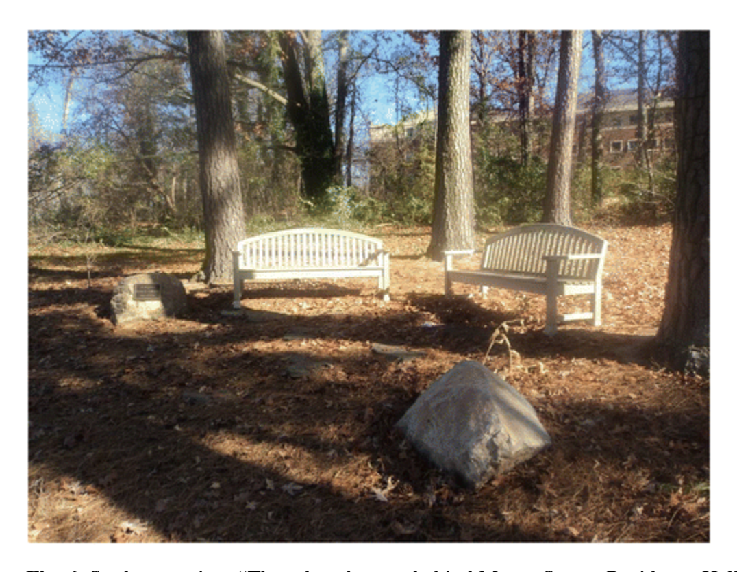
Fig. 6. Student caption: "These benches are behind Moore Strong Residence Hall near the golf course. They are such a great hide-away from the busyness of the rest of the campus. I love to relax and journal here because it is quiet, secluded, and surrounded by nature. There are trees everywhere with squirrels and chipmunks always rustling around."

Finally, the Room for Improvement theme included photos about campus areas that could be enhanced in terms of alleviating stress. Students took photos of poorly placed trash cans, a dilapidated campus structure, and spots that needed landscaping or removal of cigarette butt litter. Most photos in the Room for Improvement theme were of trash cans, and recycling cans in some instances, that were placed directly beside several campus benches (Fig. 7). Students noted that the benches had potential for alleviating stress, since the benches were located either in or near nature; however, students complained that the trash cans smelled bad and also attracted swarms of bees. A number of photos also depicted a neglected campus structure known as the "cooling tower." The tower had formerly been used by art students to cool their pottery that was taken out of kilns (Fig. 8). The tower had not been used in years and had become an area filled with graffiti and litter. Students also took photos of areas on campus that were bare, containing no trees, dead grass, dirt, and cigarette butts. These areas and the cooling tower had made students feel that the spots were unkept by the university and also disrespected by students who smoked cigarettes.