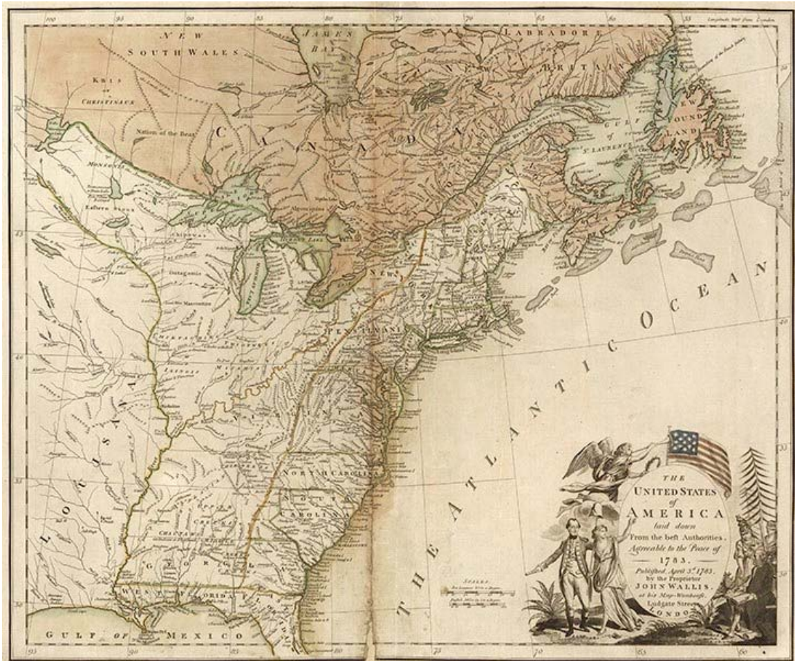
Map 3. The United States of America Laid Down from the Best Authorities, Agreeable to the Peace of 1783 , by John Wallis, 1783, from Library of Congress, Geography and Map Division (Digital Collections). 299

conditions structuring the transition to U.S. jurisdiction and the formation of western territorial government. With respect to “the French and Canadian inhabitants, and