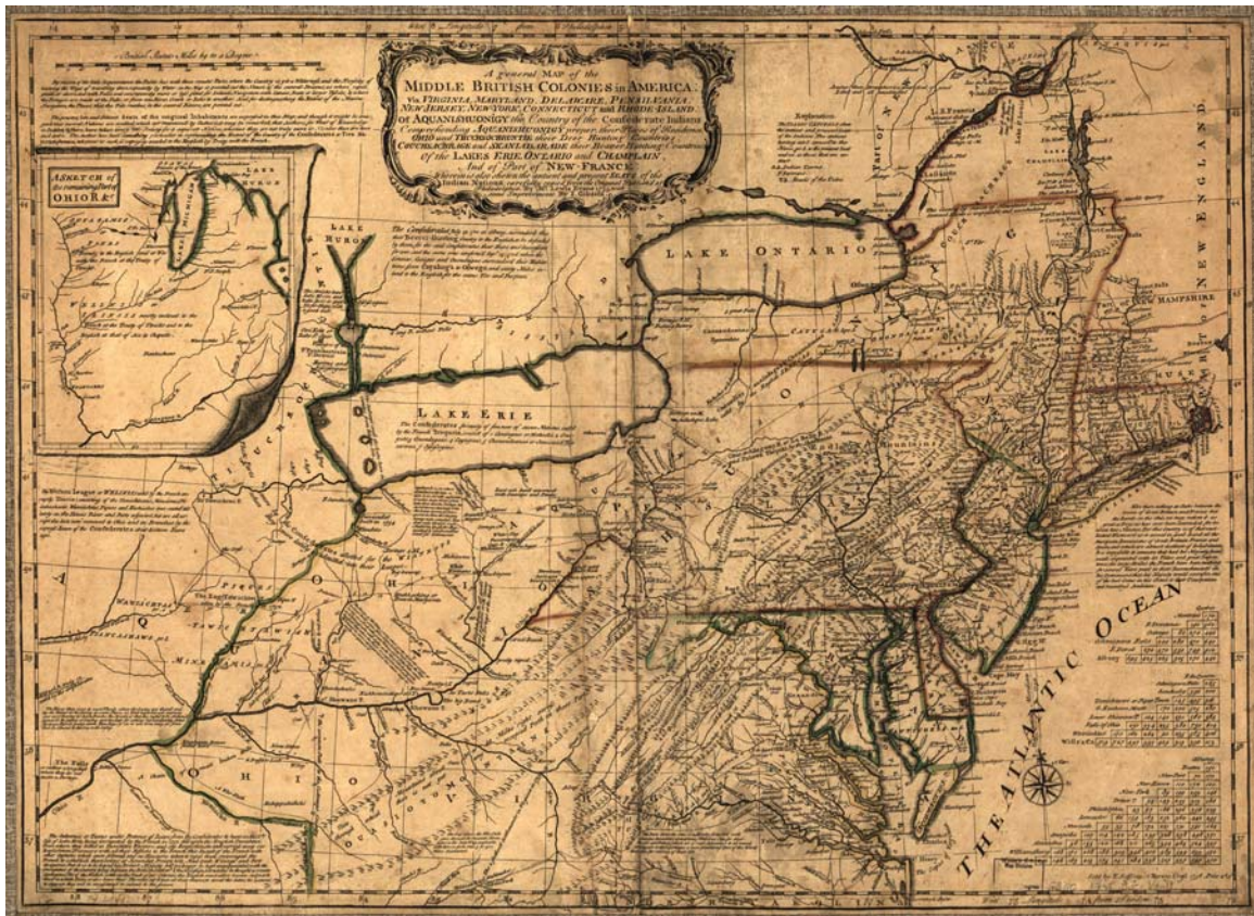
Map 2. A General Map of the Middle British Colonies in America, by Lewis Evans, 1755.

The first attempt to formally resolve these issues materialized with the Royal Proclamation of 1763. 195 The resolution's approach (or lack thereof) to the interior