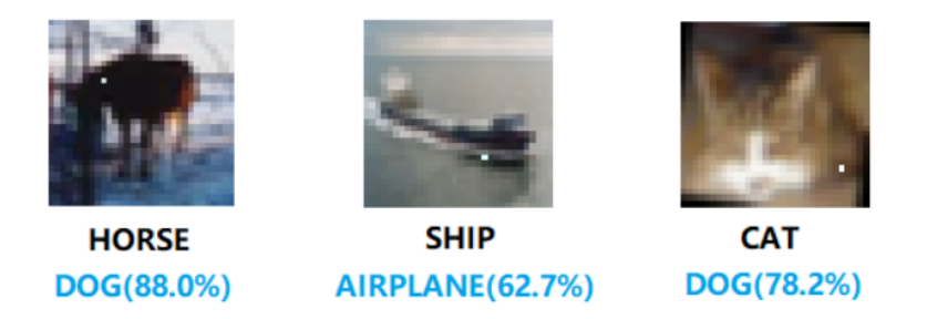
Figure 9.1: Examples of misclassification.

Guidiotti et al. (2017) for a survey. There is also a 2018 DARPA program on "Explainable AI." Techniques used can include looking at the results over a range of input data and seeing if the neural net can be modeled by a decision tree, or modifying the input data to see which input elements have the greatest effect on the results, and then showing that to the user. For example, Mariusz Bojarski et al. describe a self-driving system that highlights what it thinks is important in what it is seeing (2017). However, this is generally research in progress, and it raises the question of whether we can trust the explanation generator.