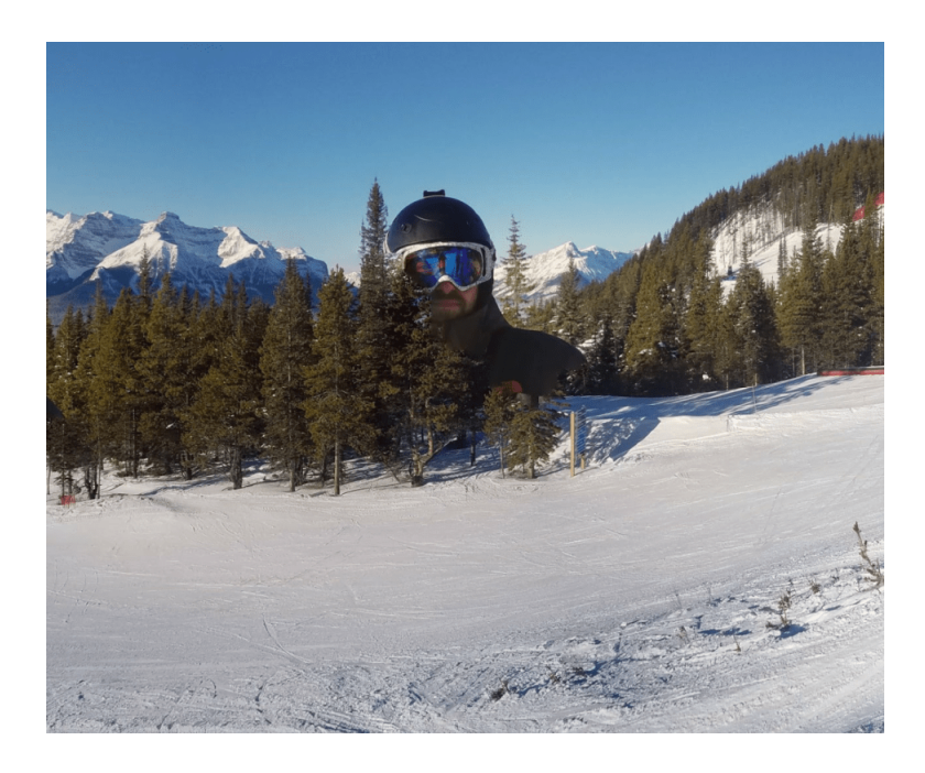
Figure 9.2: Panoramic landscape.

pet, so that the poor health is not caused by the lack of a cat, but rather the poor health causes the absence of a cat.