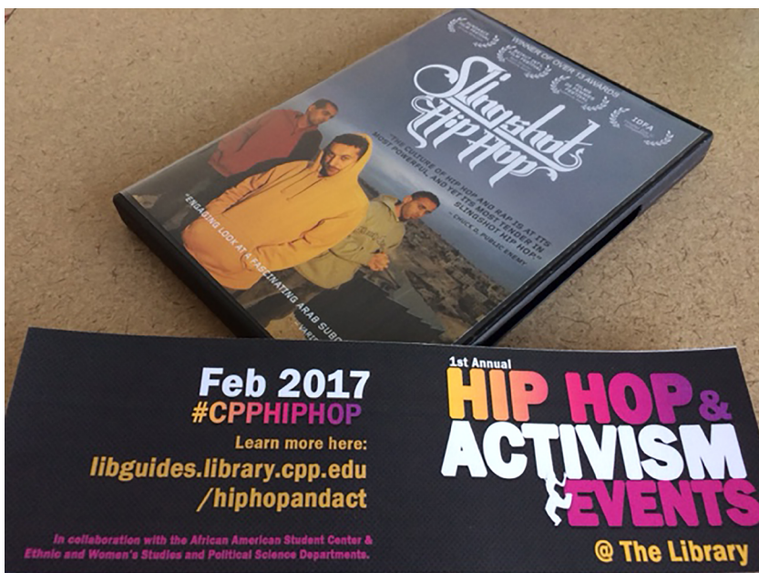
Hip Hop and Activism film and bookmark.

students having to leave early to get to their 1 p.m. classes.