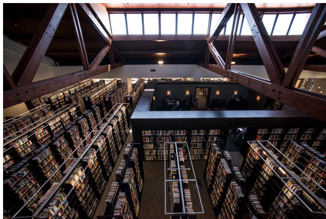
Overhead view of the Pepperdine University Payson Library stacks.

Temple University's new library will be named Charles Library in recognition of a $10 million gift from entrepreneur and uni-