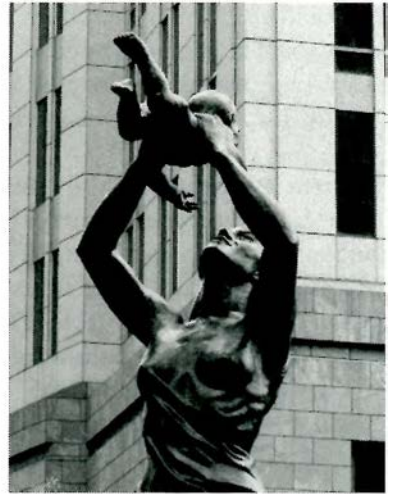
Charlotte's landmark sculptures at the corner of Trade and Tryon Streets in Uptown. The goldminer represents Charlotte's early 1800s gold rush history and the mother and baby represent Charlotte's future.

history lesson. Here you will find gravestones marking the final resting places of Charlotte slaves, planters, soldiers, politicians, and children buried from 1776 to 1884.