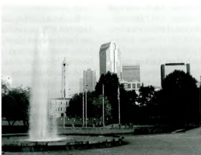
Waterscapes taken from Charlotte's Marshall Park—with the First Union Bank Building (rounded top) in the background.

In the past decade, there has been a whirlwind of growth in Charlotte, with skyscrap-