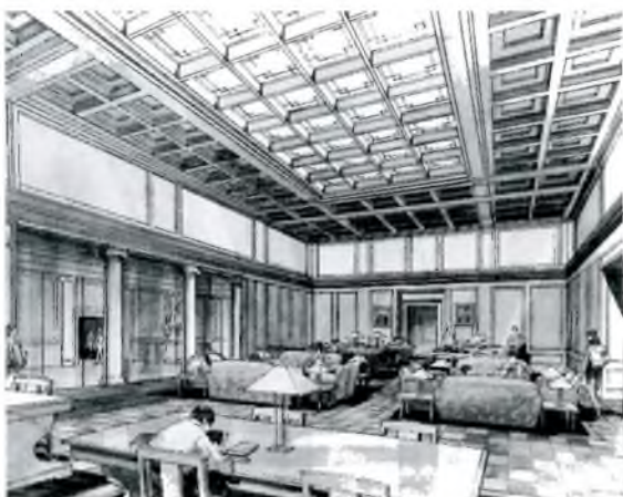
Architect's drawing of the Great Hall renovations in Rush Rhees Library at the University of Rochester.

brary at the University of Rochester has been renovated, thanks to a $500,000 gift from the Gleason Foundation. The renovation was finished in time for the university's 150th birthday during Sesquicentennial Weekend, October 12-15. The Great Hall, one of three historic rooms of the library, is rich in architectural detail, featuring intricate inlaid woodwork in the paneled oak walls. The renovation included recreating the effect of a skylight, restoring the ceiling artwork, and installing a new tile floor, acoustical panels, and exhibit cases.