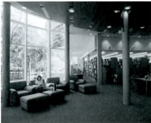
Quinnipiac University dedicated its new Arnold Bernhard Library in September. The 48,000 square-foot facility features views of the Sleeping Giant Mountain.