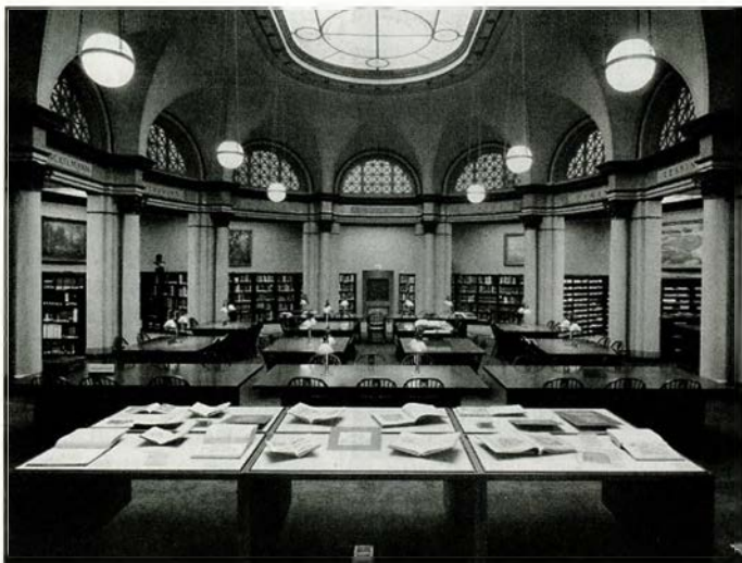
The reading room of the Ryerson and Burnham Libraries at the Art Institute of Chicago

tured fine tailoring, bright colors, and elaborate decorations, were worn by scores of Hollywood cowboys, popular country singers, and well-known celebrities. Included in the collection are customer clothing files dating from 1955 to 1970, boot patterns, photographs, correspondence, and financial records.