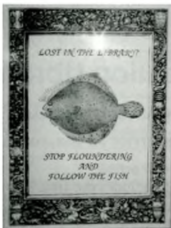
Drawings by student assistant Joel R. Cooper attract attention to this instructional exhibit.

Two cases hold "Subject Guides to Library Use." In these cases are included published bibliographies and guides to research on specific