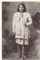
GERONIMO Apache chieftain June, 1829 - Feb. 17, 1909

A ready-made vertical file containing more than 750 portraits of famous authors...explorers...actors...musicians...scientists...and other international figures influential in shaping world history and culture