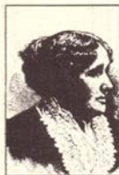
LOUISA MAY ALCOTT American novelist Nov. 29, 1832 - March 6, 1888

A ready-made vertical file containing more than 750 portraits of famous authors...explorers...actors...musicians...scientists...and other international figures influential in shaping world history and culture