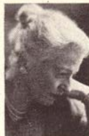
PEARL S. BUCK American novelist June 26, 1892 -