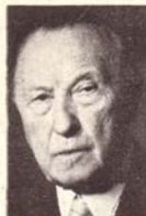
KONRAD ADENAUER German statesman Jan. 5, 1876 - April 19, 1967

AN EXCITING NEW RESOURCE IN VISUAL AIDS— Ready Now