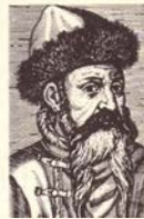
JOHANN GUTENBERG German printer c. 1400 - Feb. 23, 1468