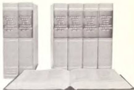
in seven bound volumes

More than 40,000 complete entries describing bibliographies were taken from 50 years of the Monthly Catalog of U.S. Government Publications, arranged alphabetically by subject, indexed by Su Docs Class Numbers, and keyed to the Bibliography Masterfile microfiche collection.