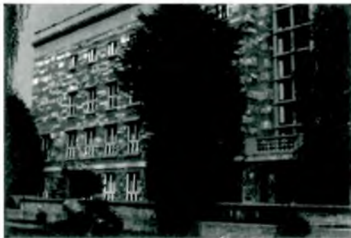
National & University Library, Ljubljana, Slovenia.

east toward Austria and Hungary. The capital city, Ljubljana, boasts one of the oldest public symphonic societies in Europe, the Academia Philharmonicorum, established in 1701, a time when most European orchestras were the property of kings, princes, archdukes, and others.