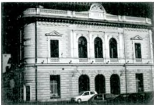
Home of the oldest public symphony society in Europe, the Academia Philharmonicorum, 1701, Ljubljana.

National Ethnomusic Archive: A particularly exciting part of the initiative is a relationship with the Institute of Ethnomusicology, whereby copies of the entire Slovenian National Ethnomusic Archive scores will be made available to the UWM Library. While touring this archive, housed in an old building of wooden infrastructure, I learned that the staff was planning to photocopy the entire printed archive for storage in a different building. I suggested that they make an additional copy for us, at the UWM Library's expense, and this was agreed to in