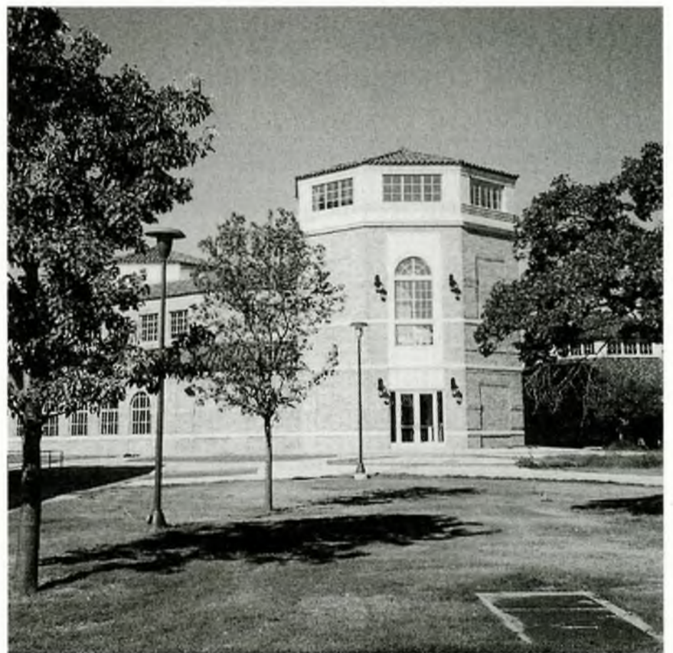
Texas Tech University's new Southwest Collection/Special Collections Library houses the Southwest Collection, Rare Books Collection, the Vietnam Archive, and the University Archives.