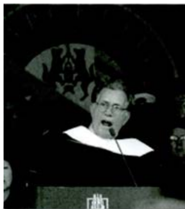
Actor Martin Sheen spoke at the dedication ceremony for Marquette University's new John P. Raynor, S.J. Library.

The University of Illinois at Urbana-Champaign (UIUC), the largest public university library in the world, has acquired its 10 millionth volume. Library officials describe the volume as "a labor of love to the