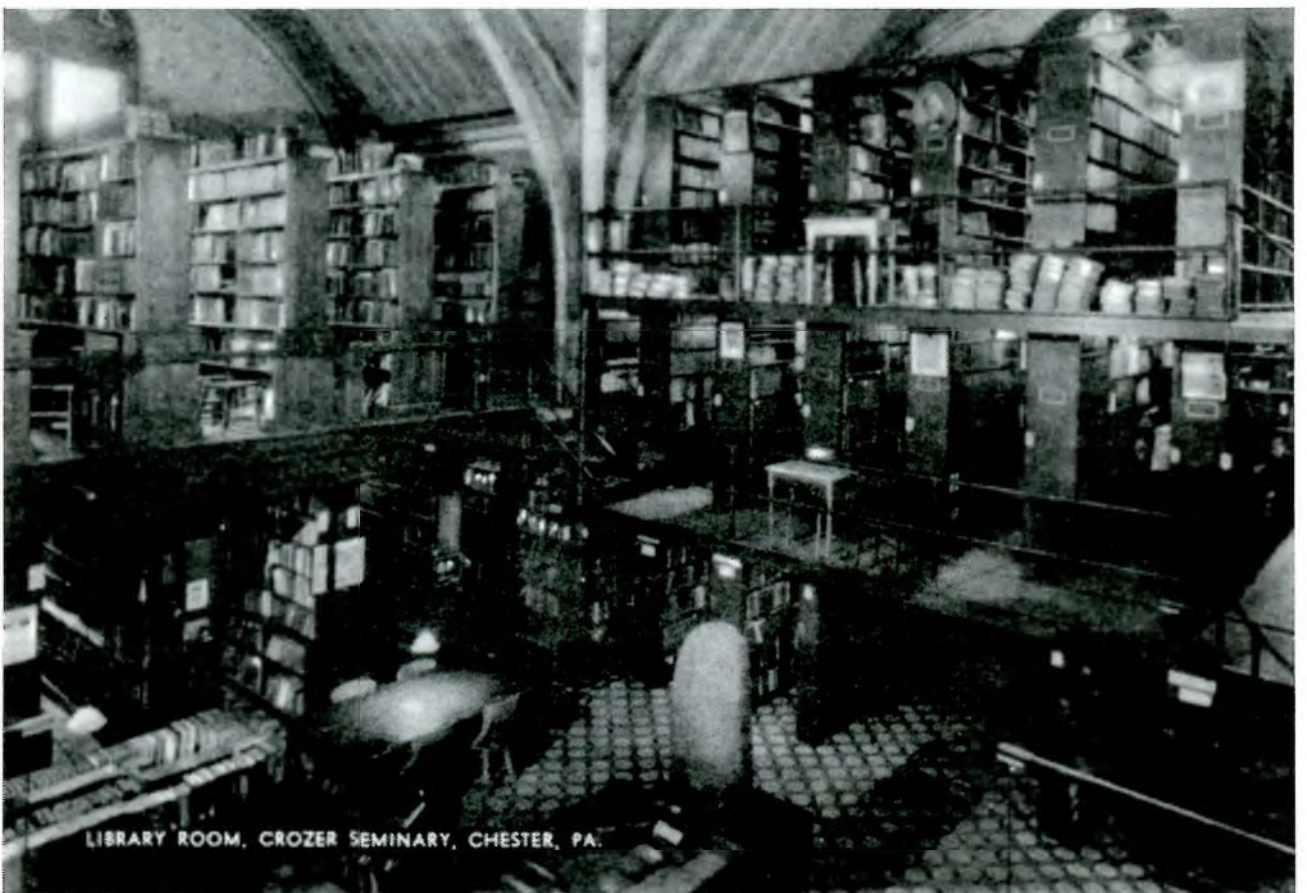
Fig. 4. Library Room, Crozer Seminary, Chester, Pennsylvania.