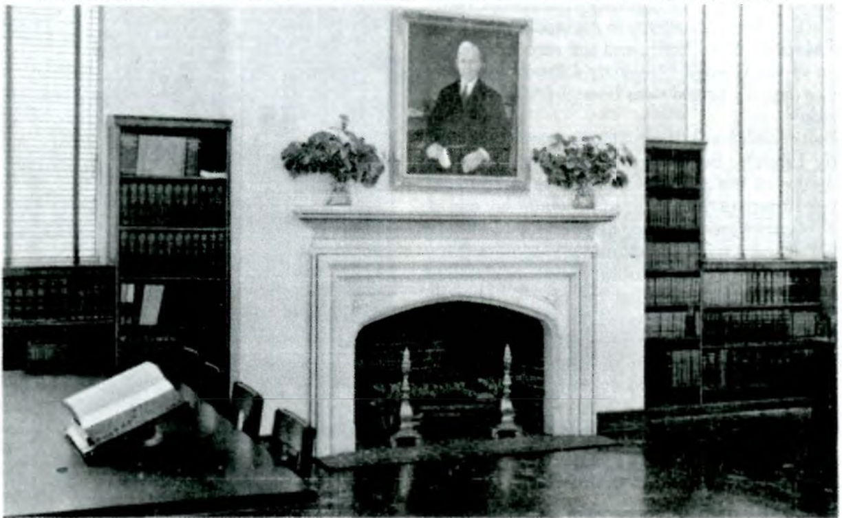
Fig. 8. Reference Room, Carl A. Rudisill Library, Lenoir Rhyne College, Hickory, North Carolina.

H-23 REFERENCE ROOM OF THE CARL A. RUDISILL LIBRARY, LENOIR RHYNE COLLEGE, HICKORY, N. C.