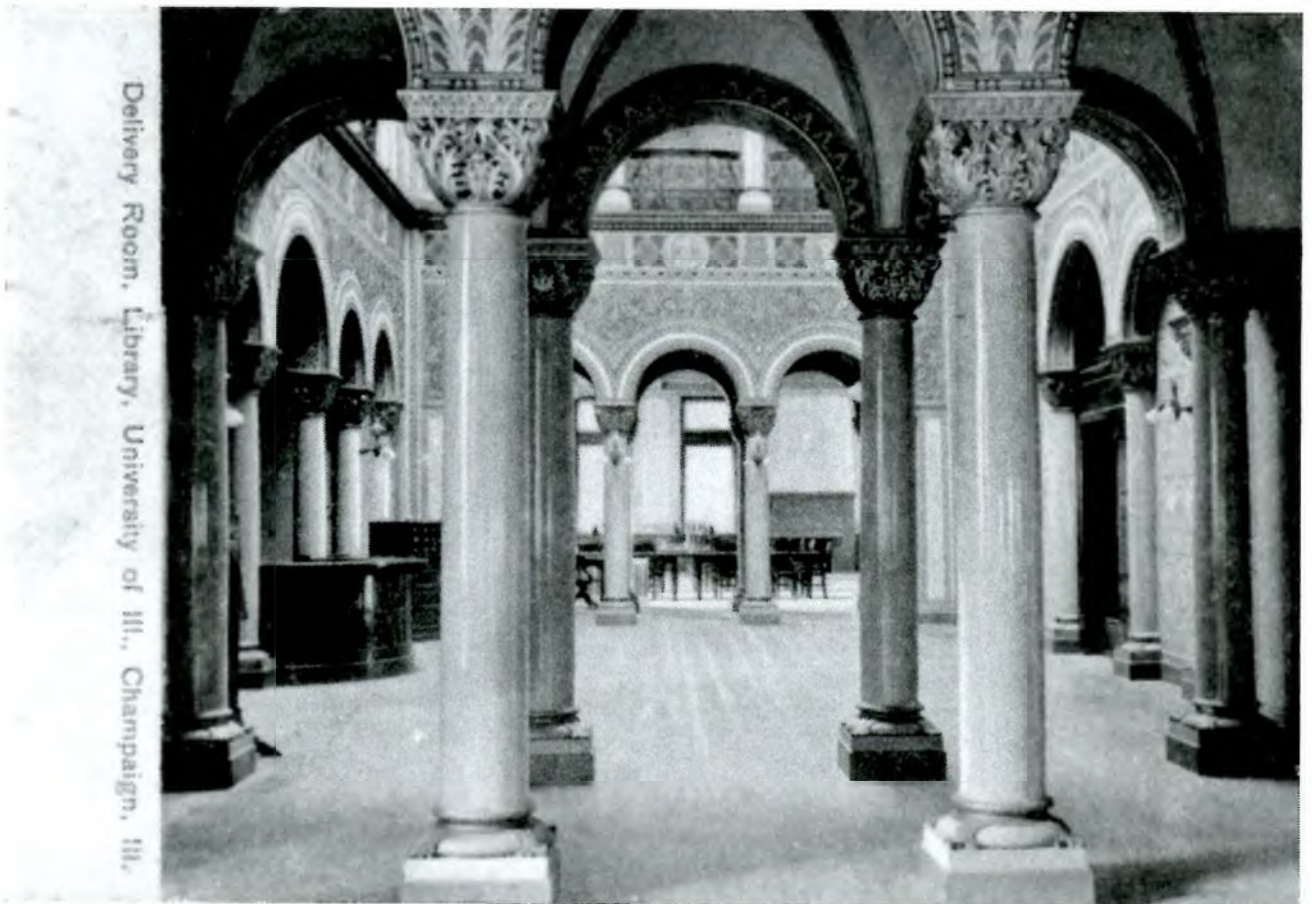
Fig. 2. Delivery Room, University Library, University of Illinois at Urbana-Champaign.