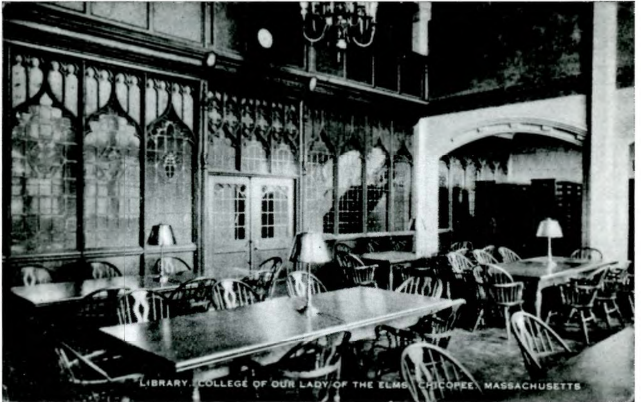
Fig. 3. Reading Room, Library, College of Our Lady of the Elms, Chicopee, Massachusetts.