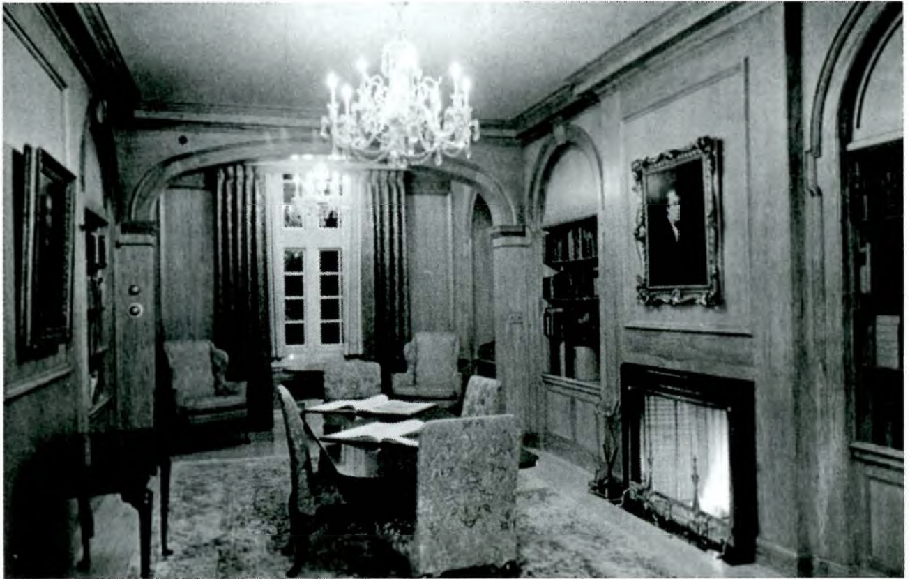
Fig. 7. The Poetry Room, Lilly Library, Indiana University.

H-23 REFERENCE ROOM OF THE CARL A. RUDISILL LIBRARY, LENOIR RHYNE COLLEGE, HICKORY, N. C.