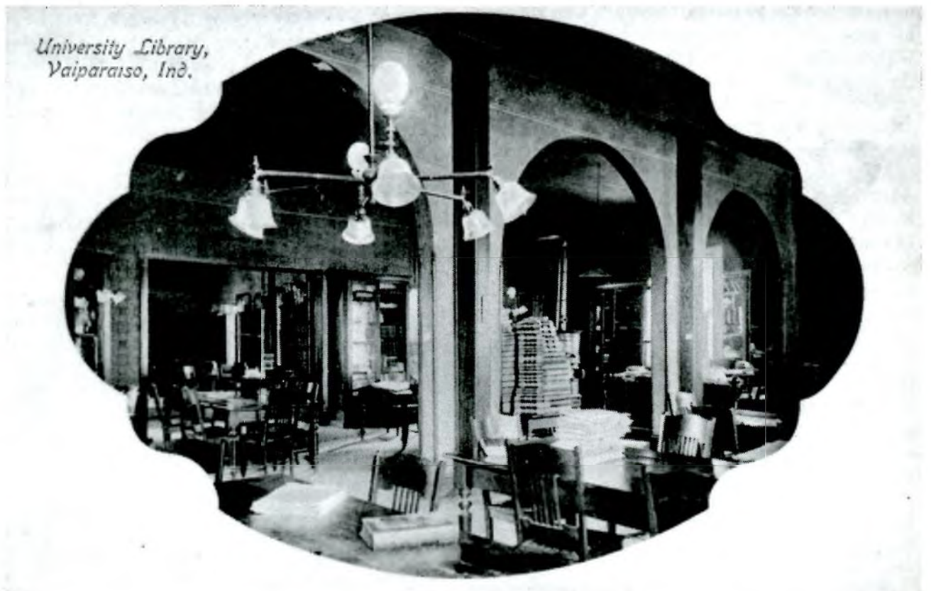
Fig. 6. Reading Room, University Library, Valparaiso University, Indiana.