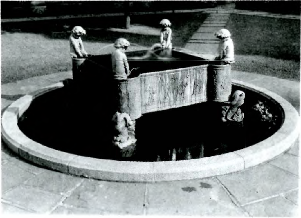
Fig. 1. Fountain, University Librarian's Court Yard, Sterling Library, Yale University.