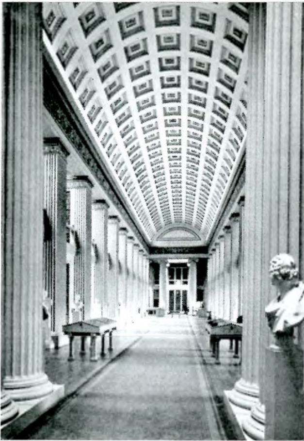
Fig. 5. Upper Library, Old College, University of Edinburgh, Scotland.