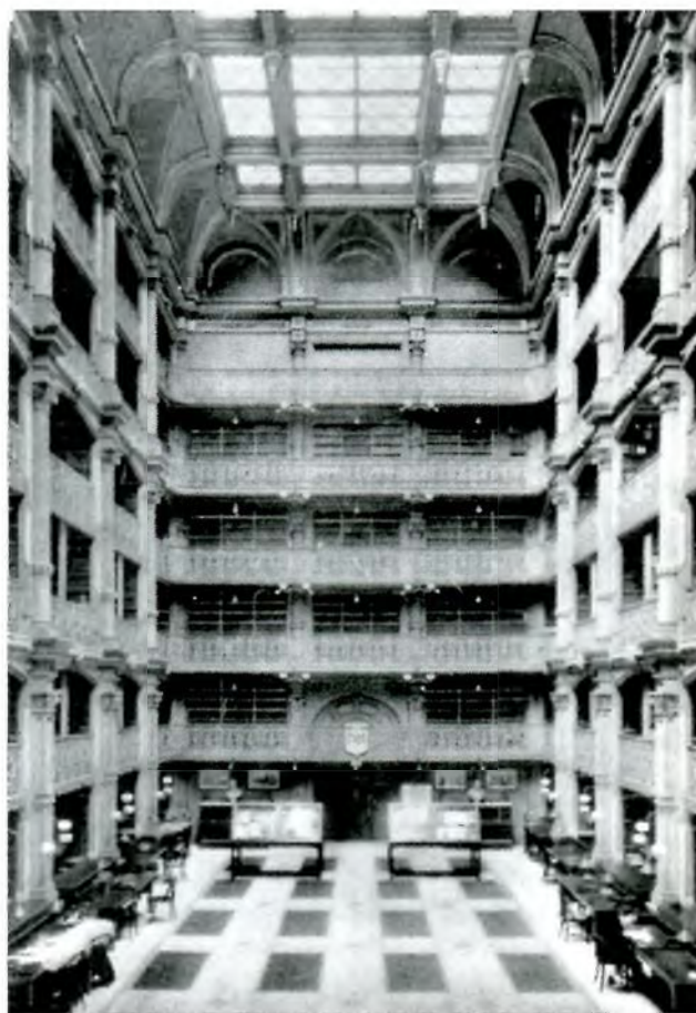
Fig. 10. Interior, Peabody Library, Peabody Institute, Baltimore.

It is impossible to list the many donors (some as far away as Brazil) who responded to the plea for postals by the author in his first article. He, how-