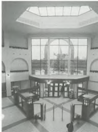
Wayne State's David Adamany Undergraduate Library

a "cybrary." The Halle Library is a modern learning resources and technologies system that provides information on demand. The library features a computing commons, five computer learning labs, a faculty/staff training computer/video room, a state-of-the-art video production facility, head-end facilities for all electronic media, a multimedia self-production facility, a teleconferencing room, two distance learning classrooms, a multimedia commons, an information commons, a multimedia auditorium, four multimedia conference rooms, and a faculty commons. For more information: http://www.emich.edu .