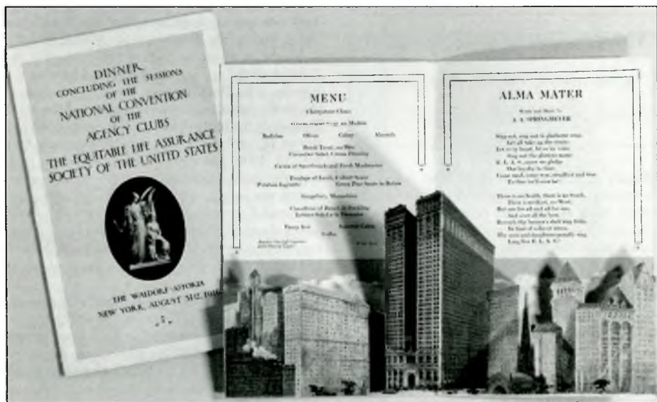
The menu from the Equitable Life Insurance Society's National Convention featured a hand-colored, pop-up skyline of New York City.