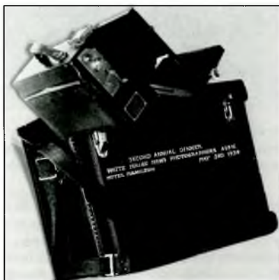
This realistic-looking camera bag and camera was the menu for a 1924 meeting of the White House News Photographers Association. The flap on the back of the camera opens to reveal the menu.

The development of menu collections is a relatively easy and very enjoyable task. Decisions are made first regarding type of establishment or event and geographic coverage, then letters of request are sent to appropriate restaurants; most are more than happy to send one copy of their menu to an academic institution. In addition, faculty, friends,