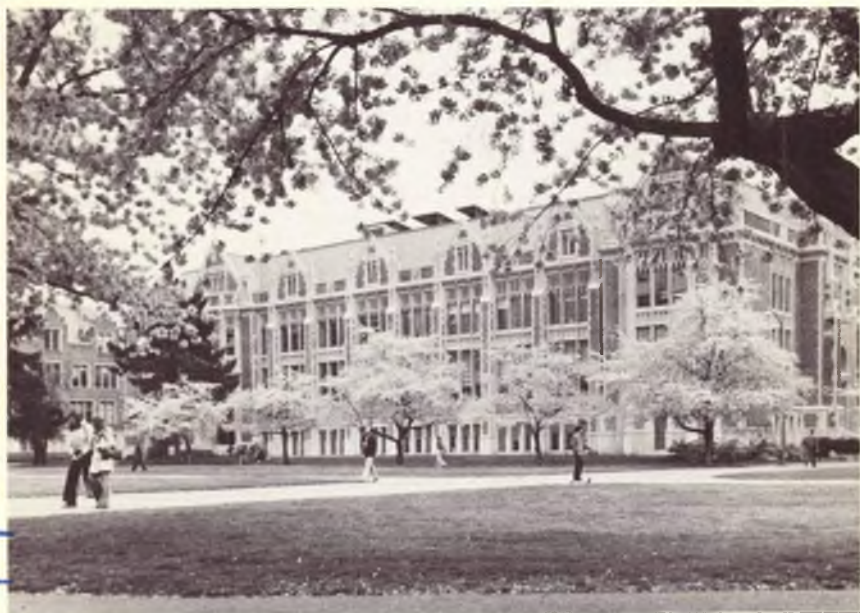
Spring cherry blossoms on the University of Washington campus, Seattle.