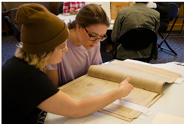
Indiana University students working with materials from the Jonathan Krause Rare Newspaper and Magazine Collection.

More information is available at https://libraries.indiana.edu/krausecollection .