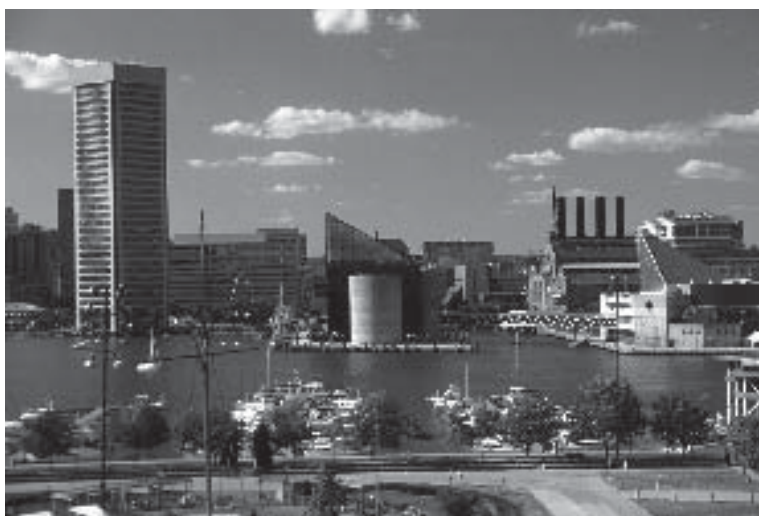
A view of the Baltimore Inner Harbor.

Water was critical to the economic development of the city. Settlers built mills and