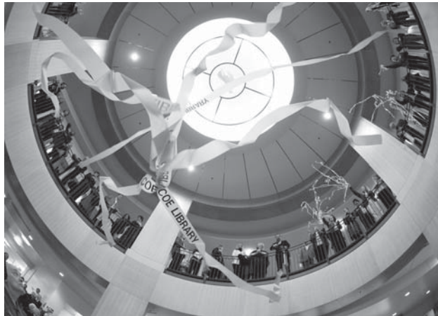
Dedication ceremony for the William Robertson Coe Library.

Under the new policy, Oberlin faculty and professional staff will make their peer-reviewed, scholarly articles openly accessible in a digital archive managed by the Oberlin College Library as part of the OhioLINK Digital Resource Commons. Oberlin authors may opt out of the policy for a specific article if they are not in a position to sign journal publishing agreements that are compatible with the policy, or for other reasons.