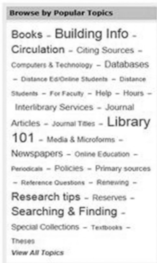
Topic Word Cloud from the Meriam Library's LibAnswers

When answered, the patron receives an e-mail with the response. Additionally, when the librarian replies to a question they are able to decide if it will be private or public. A private answer is only viewable by librarians within LibAnswers, while a public question- and-answer pair is viewable in the