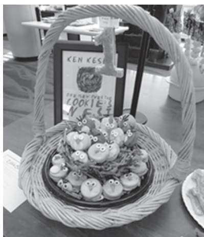
An RUL edible book entry.

An edible books festival can be a creative, fun, and an educational event that can happen in any library. It can provide an opportunity to start conversations about the library and library issues. At a recent RU edible book festival, there