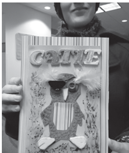
Sample card-making entry from RUL event.