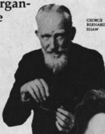
GEORGE BERNARD SHAW