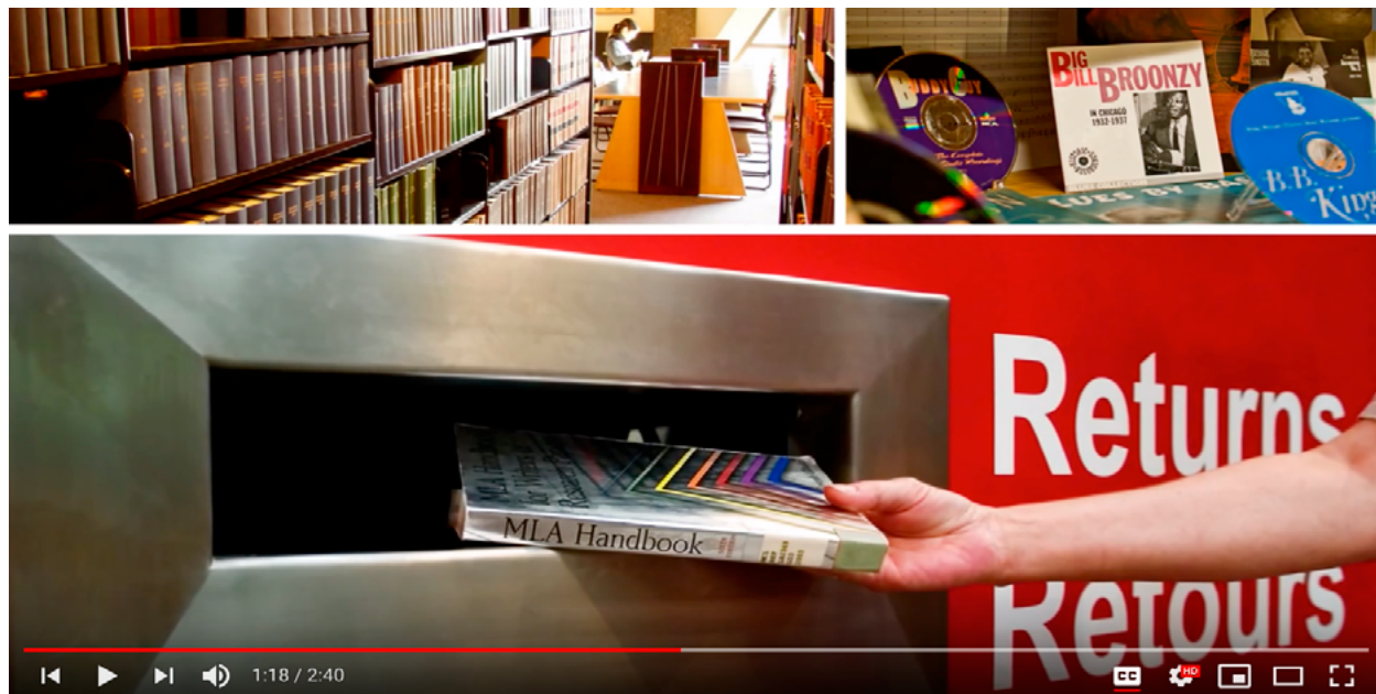
FIGURE 2 Simultaneous Use of Still Images and Moving Footage

In this screenshot, the bottom footage is running to show people using a “returns” slot to return a book while the top two still images are presenting the library’s collections.