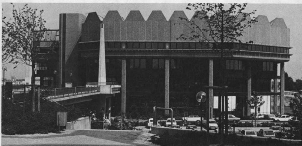
Library, University of Dortmund.

On the first floor, which because of a mezzanine is in part two-storied high, there is near the main entrance a tiered floor audito-