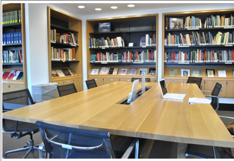
FIGURE 4 Student Photo of the Hunter College Art Library

within the CUNY system. These libraries often had been renovated or remodeled more recently than students' home college libraries; they sometimes contained additional amenities such as specialized lighting and comfortable seating. All of these combined to create a more scholarly, "serious" library atmosphere that these students preferred to what they experienced at their home college libraries. This accords with research at diverse institutions such as the University of Rochester, 34 the University of Illinois Springfield, 35 and the University of Maryland, University of Arizona, and University of Illinois Urbana-Champaign, 36 which has revealed that, for many students, a traditional academic library full of books and formal furniture provides a serious setting that they found encourages and supports their academic work.