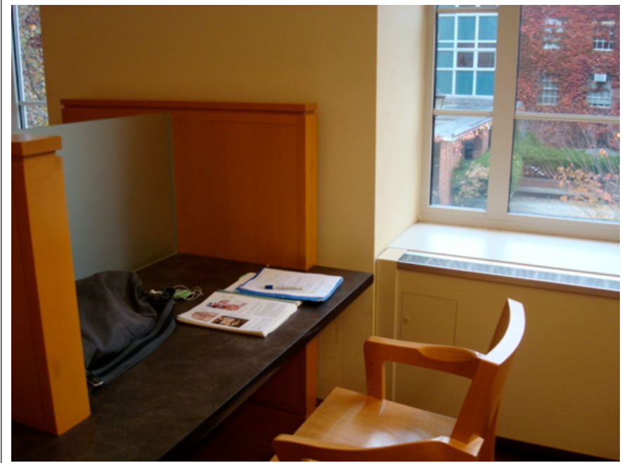
FIGURE 2 Student Photo of Study Carrel at the Brooklyn College Library

Yeah, the carrel desk. 'Cause it's, like, uh, I have, like, some privacy which is, uh, a thing lacking at ... So, I have some kinda privacy when I study in those types of things.