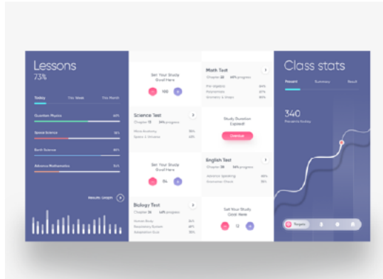
Figure 2: The system’s dashboard will only be accessible through the teacher’s login so that only he and his managers can access the reports issued by students.

schedule, presented in a monthly timeline graph format.