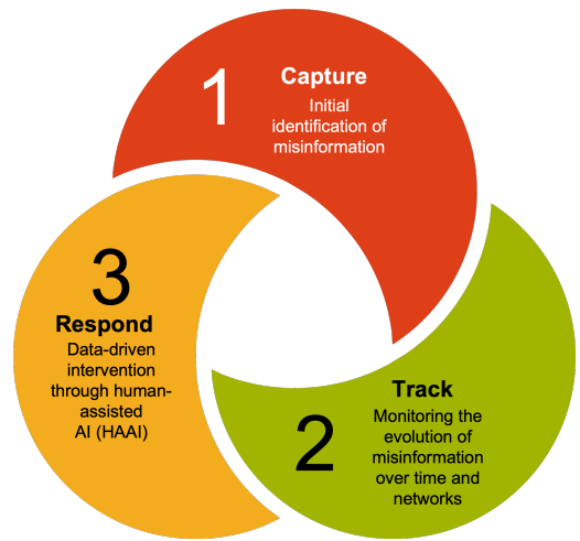
Figure 1: A graphical summary of the proposed CTR framework

To address the rapidly shifting nature of online misinformation at a scale, this paper introduces a unified Capture-Track-Respond (CTR) framework. This framework incorporates machine learning, data mining, and NLP methods whose seamless integration is designed to scale and adapt to evolving misinformation trends. Figure 1 provides a high-level overview of the proposed CTR framework. As we will outline in subsequent sections, each component in CTR (Capture, Track, and Respond) targets a specific stage in the misinformation lifecycle. By doing so, the framework not