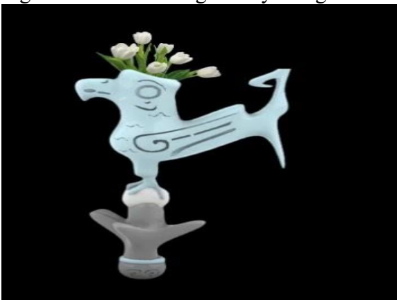
Figure 2: Siyu liu: "Bronze God Bird Refrigerator Sticker", 2023, Guided by Min li.